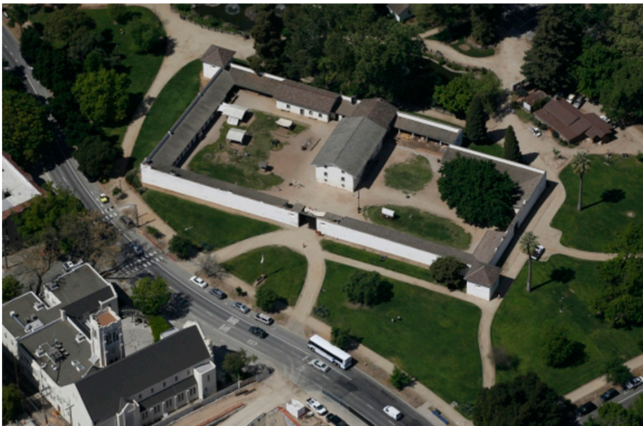
Aerial view of Sutter's Fort State Historic Park.

Policies in this section facilitate the continued operation and new development of diverse facilities and programs that are accessible to residents and visitors alike and maintain and strengthen Sacramento's role as the primary center of culture in the region. These major destination attractions provide important local opportunities for residents and school children to learn about history, science, art, culture, wildlife species, and the environment.