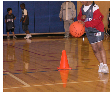
Youth basketball camp.