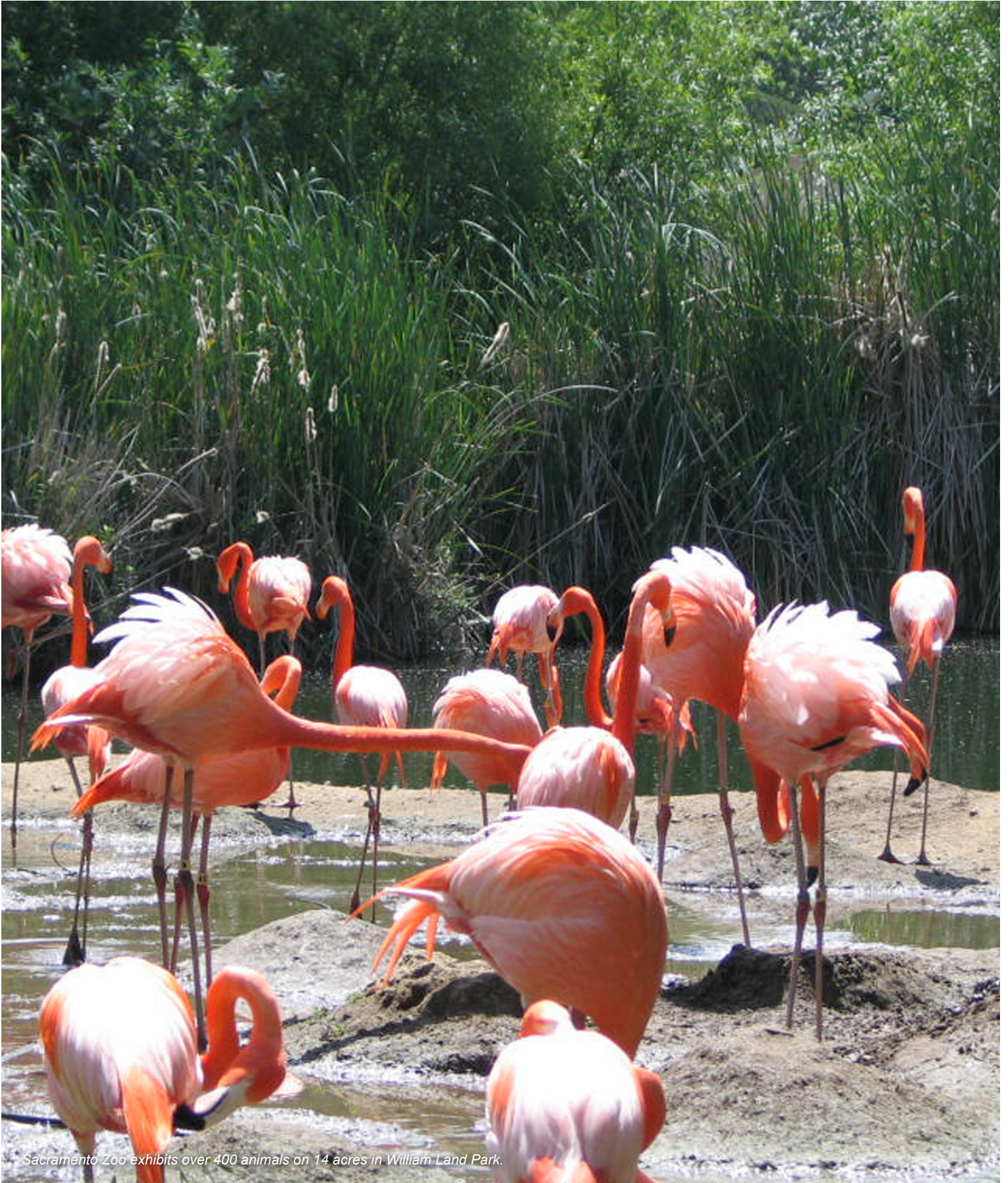
Sacramento Zoo exhibits over 400 animals on 14 acres in William Land Park.