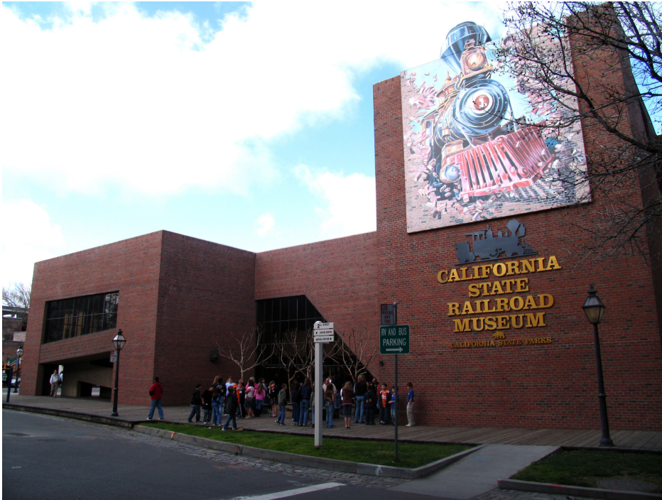
The California State Railroad Museum is within the Old Sacramento Historic District and offers railroad heritage experiences and tours to Sacramento residents and visitors.

ERC 5.1.5 Old Sacramento Historic District. The City shall maintain and protect the Old Sacramento Historic District, as defined in the 1967 Redevelopment Plan, while recognizing its importance for tourism and its role as a commercial district. (RDR/MPSP)