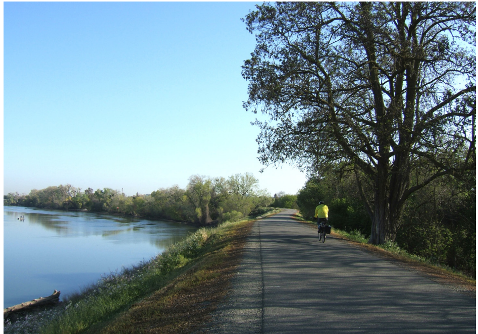
Recreational multi-use path along the Sacramento River.

ERC 2.5.2 River Parkway. The City shall coordinate with Sacramento County and other agencies and organizations to secure funding to patrol, maintain, and enhance the American River and Sacramento River Parkways. (FB/IGC/JP)