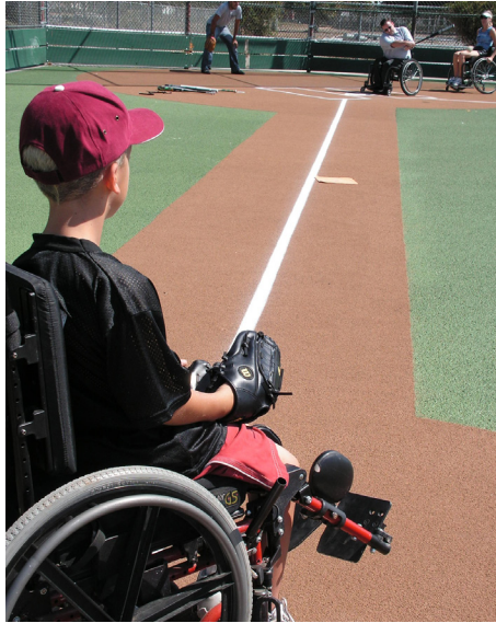
A baseball diamond with specialized surface that enables people of all abilities access to play.

ERC 2.3.1 Interpretation and Celebration. The City shall provide recreation programming, special events and venues, and educational opportunities that honor, interpret, and celebrate the diversity, history, cultural heritage, and traditions of Sacramento. (MPSP/SO/PI)