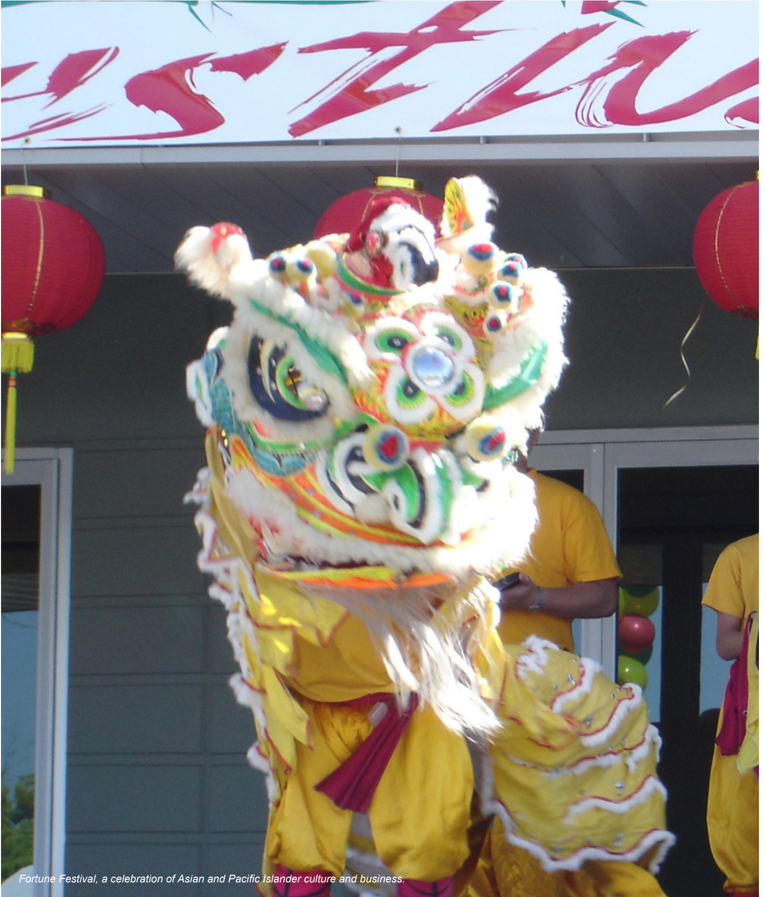
Fortune Festival, a celebration of Asian and Pacific Islander culture and business.