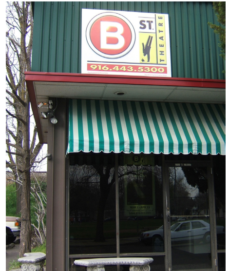
The B Street Theatre in midtown Sacramento provides live theater to general audiences, families, and school children.