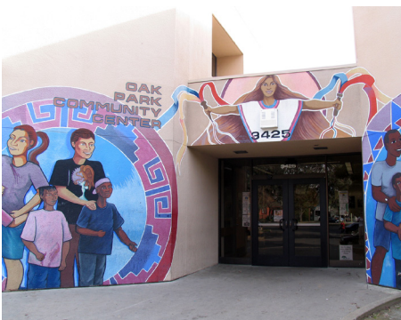
The Oak Park Community Center provides arts and activities for youths, adults, and seniors.

ERC 4.1.11 Programs for Children. The City shall support programs and events that introduce children to the arts and provide positive outlets to explore their own talents and creativity for self-expression. (MPSP/PI)