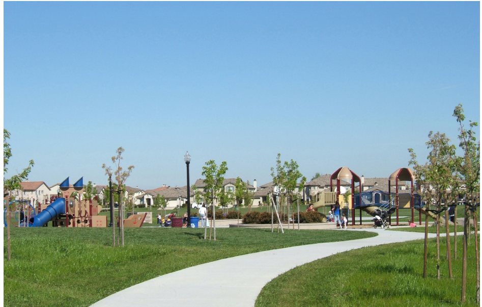
Universal playground, accessible to people of all ages and abilities.

Parks, Community and Recreation Facilities and Services. Plan and develop parks, community and recreation facilities, and services that enhance community livability; improve public health and safety; are equitably distributed throughout the city; and are responsive to the needs and interests of residents, employees, and visitors.