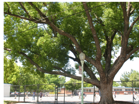
Elementary school in the Tahoe Park neighborhood.

See LU 8, Public/Quasi-Public and Special Uses for additional policies on schools and school locations.