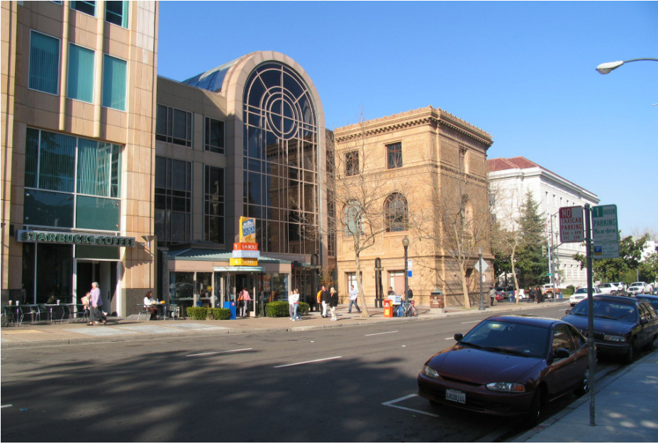
The Downtown Sacramento Central Public Library & Galleria is a multi-functional facility incorporating meeting space with traditional library uses.