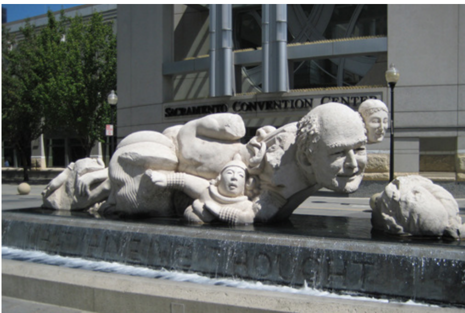
Public art at the west entrance of the Sacramento Convention Center.