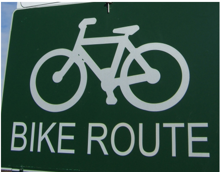
The Two Rivers Bike Trail provides a bike route along the south side of the American River within the Richards Boulevard area and connections to other local and regional trails.