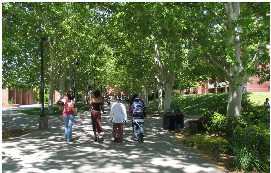
Cosumnes River Community College opened in 1970.

ERC 1.1.6 Higher Education and K–12 School Districts. The City shall encourage higher education institutions to strengthen their links with local K–12 school districts to facilitate the transfer of students into these institutions. (IGC)