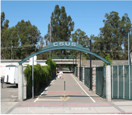
A pedestrian walkway connects the Sacramento State campus to surrounding businesses and residences.