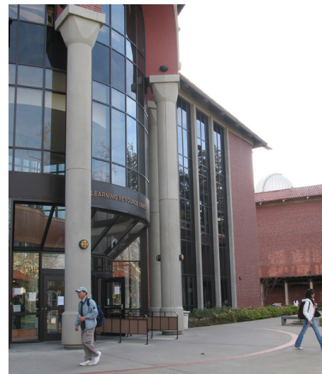
Sacramento City College Learning Resource Center.

ERC 1.1.3 Schools in Urban Areas. The City shall work with school districts in urban areas to explore the use of existing smaller sites to accommodate lower enrollments, and/or higher intensity facilities (e.g., multi-story buildings, underground parking, and playgrounds on roofs). (IGC)