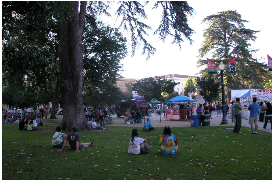
Friday Night Concert in the Park event at Cesar Chavez Plaza Park in downtown Sacramento.

ERC 4.1.8 Conservation of Resources. The City shall fund the conservation of its art and archival collection and official records. (FB)