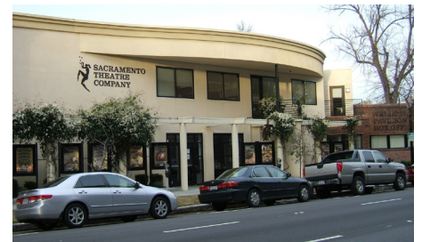
The Sacramento Theatre Company in downtown Sacramento, opened in 1942, presents public performances of classical and modern plays in two theatres with more than 300 performances per year.