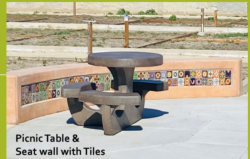
Picnic Table & Seat wall with Tiles