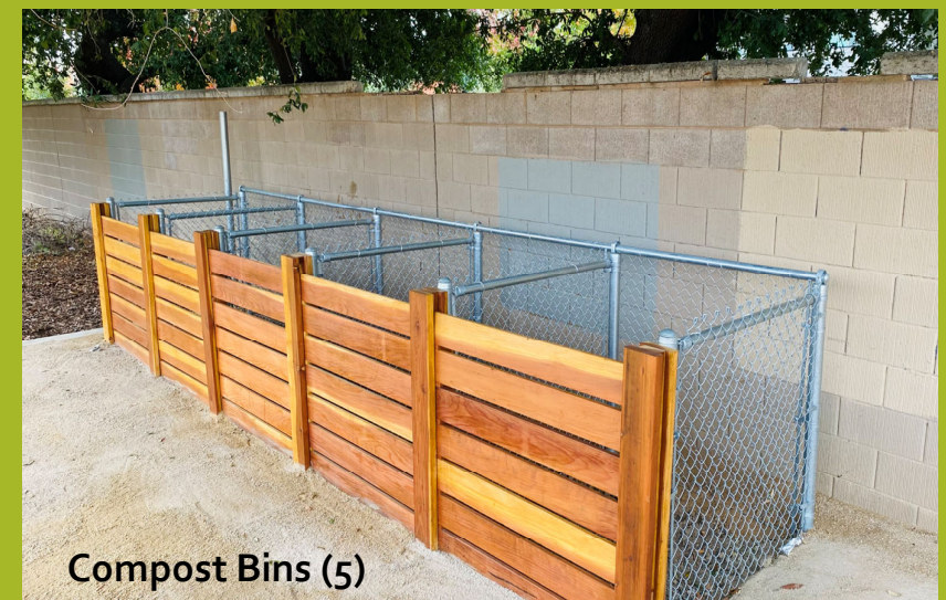
Compost Bins (5)