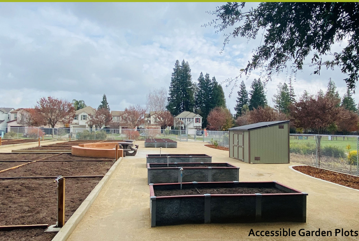
Accessible Garden Plots