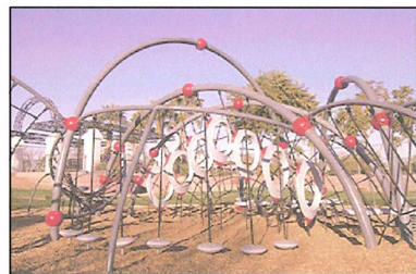
ADVENTURE PLAY (AGES 5-12)