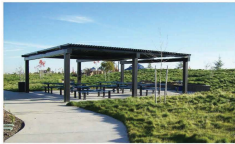
LAKE FRONT PICNIC AREA (SHADE STRUCTURE AS ADD ALTERNATE)