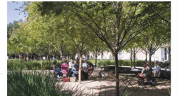
TREE BOSQUE SEATING AREA W/ CONCRETE GAMES