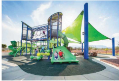
PLAY AREA W/ INCLUSIVE ELEMENTS