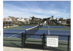
FENCED PICKLE BALL COURTS

SITE AMENITIES PLAN APPROVED BY CITY COUNCIL ON 11/15/2022