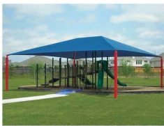
PLAY AREA SHADE STRUCTURE