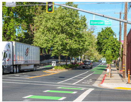
📷 BROADWAY COMPLETE STREET