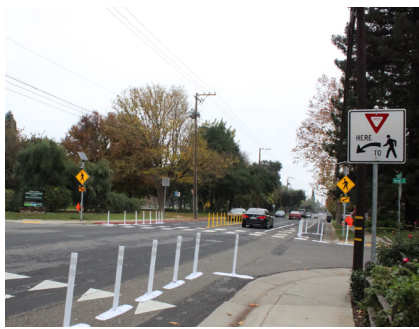
📷 SUTTERVILLE ROAD QUICK-BUILD