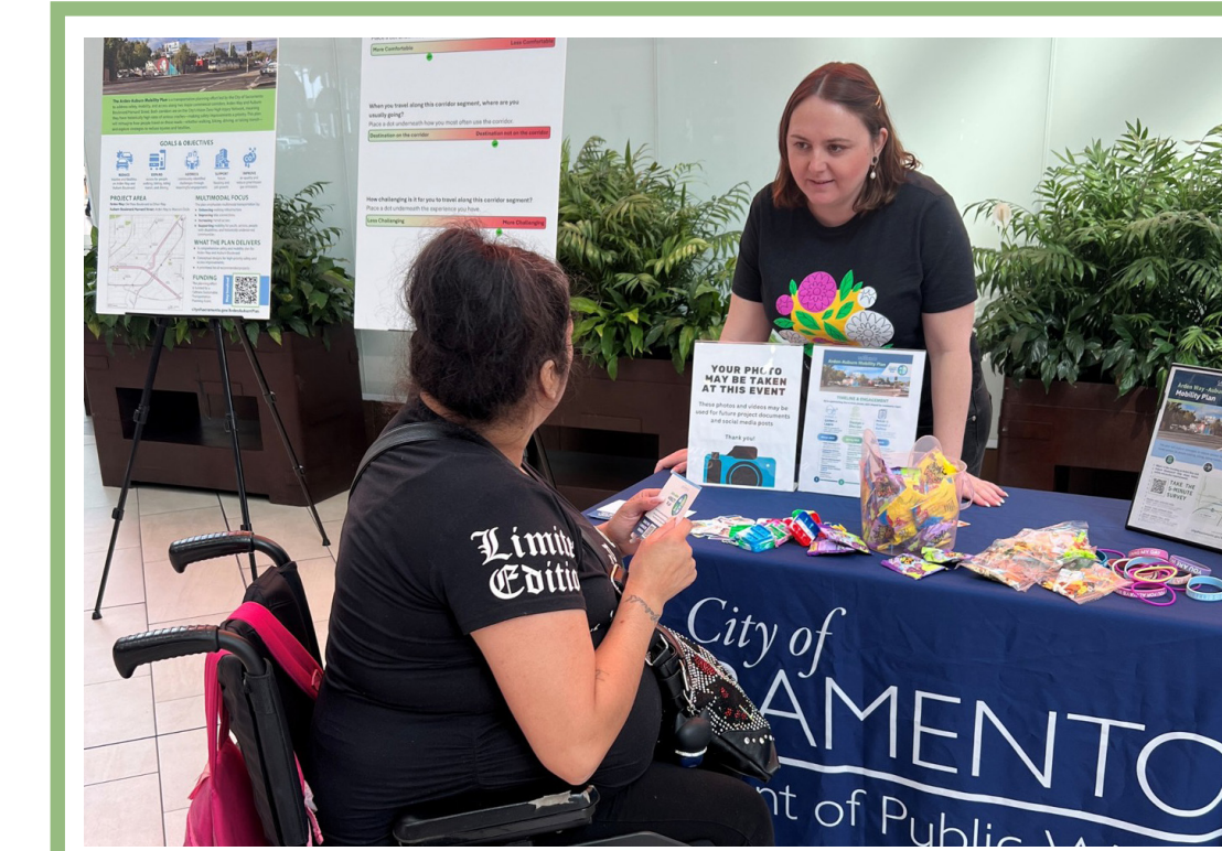
Project team tabling at Arden Fair Mall

"My primary access to work is Auburn Boulevard. The number of people trying to walk on the side of the road where there are not many lights at night, no shoulder/ no sidewalk, is scary to navigate, even for someone who drives it regularly."