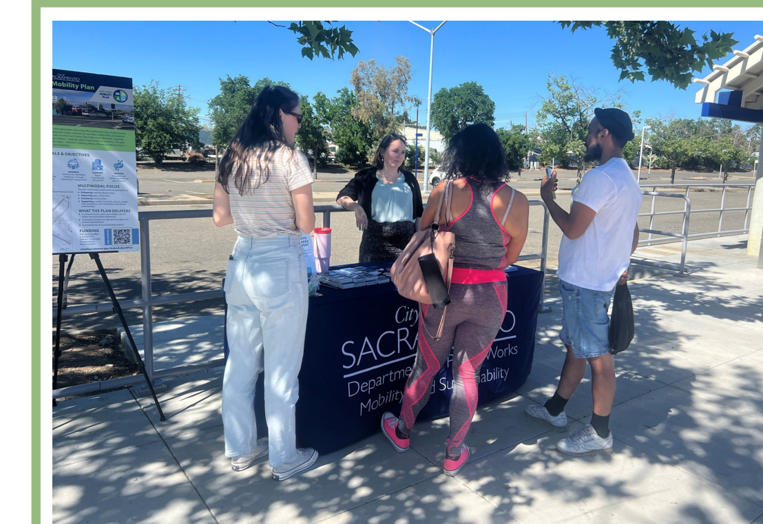
Project team tabling at the SacRT Swanston Light Rail Station

"Nicely paved sidewalks, room between fast-moving cars and peds, up-to-date crosswalks."