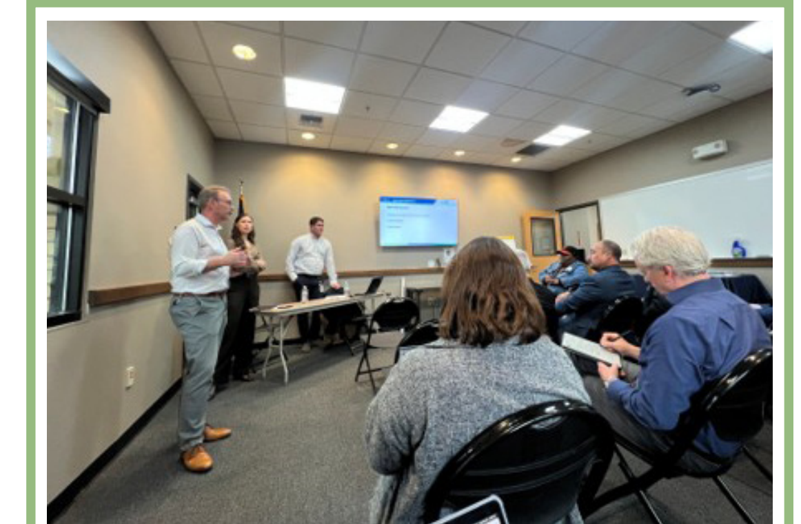
Project team discussion with the community-based focus group meeting