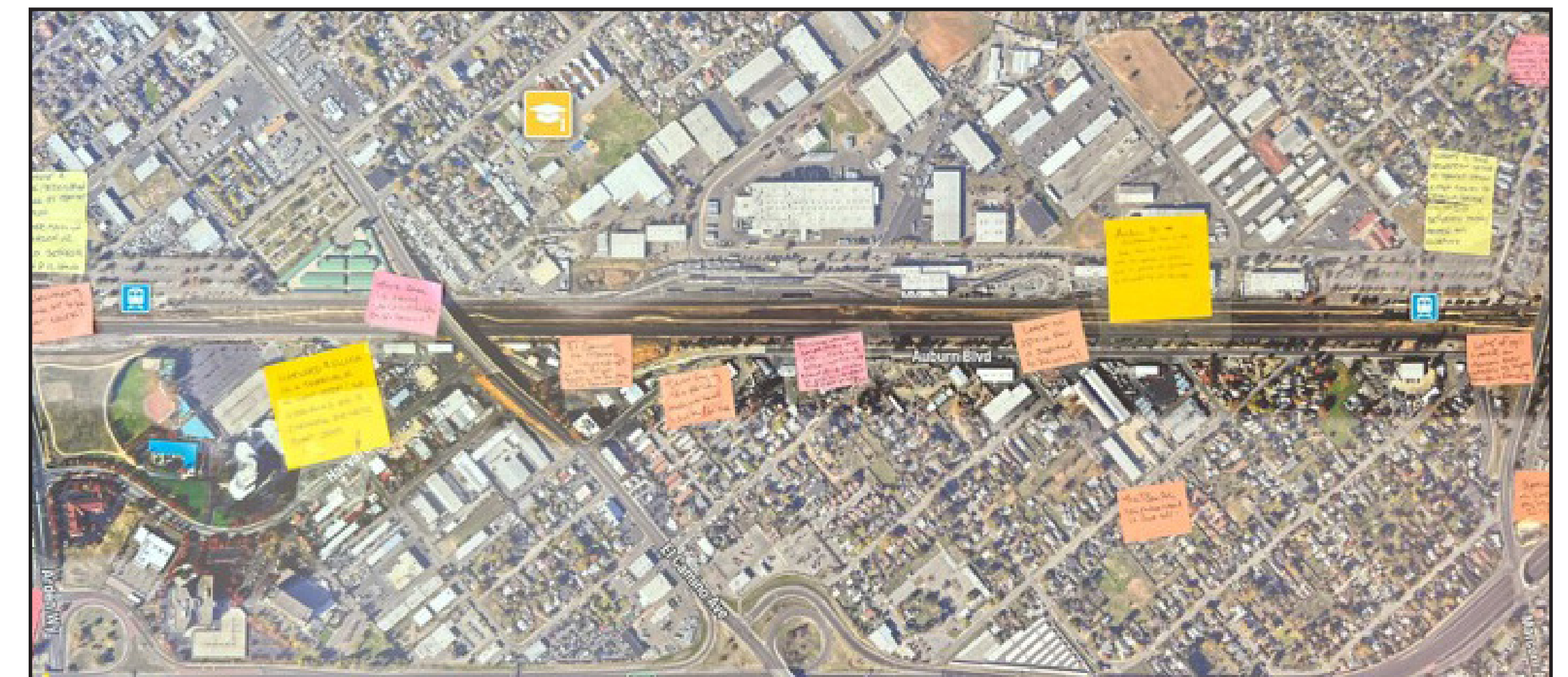
Comments from the first Community Workshop, focused on Auburn Boulevard

Would your community like a presentation from the project team?