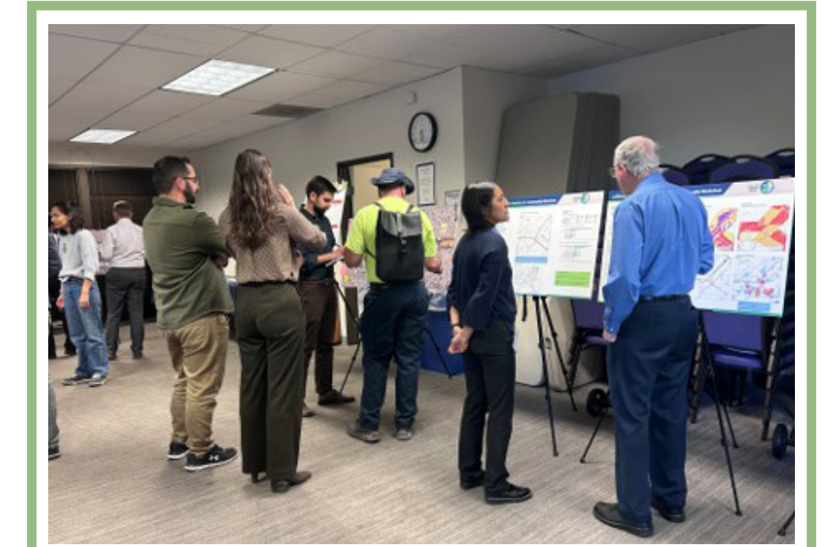
Community members reviewing project exhibits during the Phase 1 Community Workshop