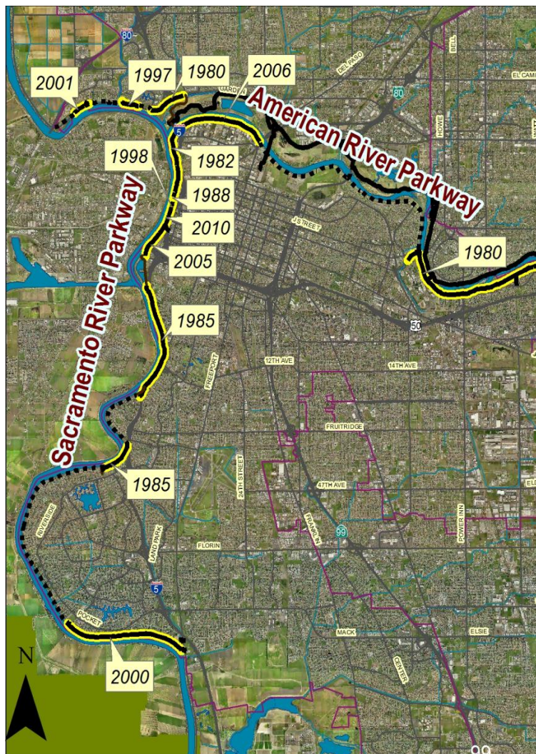
Table 1 below (page 10) provides a summary of implementation actions in both the American and Sacramento River Parkways, taken by the City in cooperation with others, to further the City's vision of "on-Rivers" paved public trails. The reporting timeframe is 1998-present, and includes projects both completed and in progress. All of these actions are required to be and are consistent with the City's previously adopted plans and policies described above.

13 projects completed in 13 years totaling 13 miles of total 25 potential