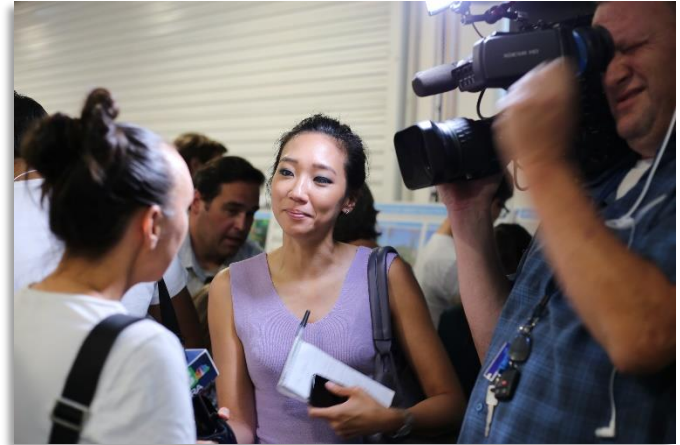
Channel 3 interviewing a community member

( https://www.cityofsacramento.org/Public-Works/Transportation/Planning-Projects/Envision-Broadway-In-Oak-Park )