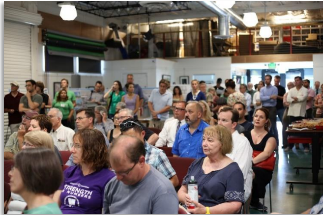
Community members at the open house

Below is a compilation of comment cards received regarding the Broadway Complete Streets Plan during the open house.