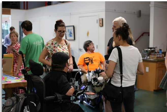
Community members at the open house

(Staff feedback: We are evaluating options to best balance and accommodate bikes, buses and parking.)