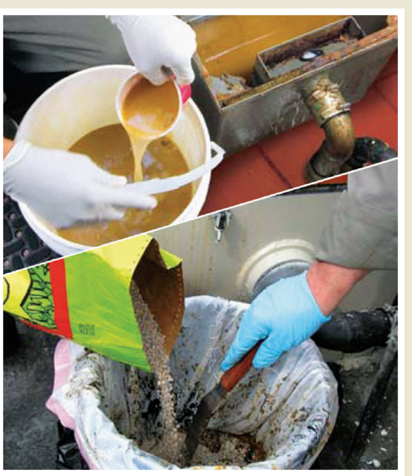
Keep grease traps and interceptors clean.