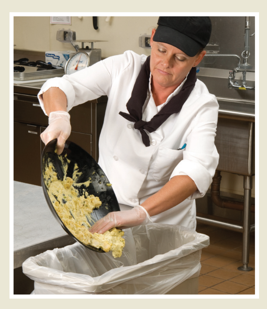
Dry wipe all food waste from dishware, cookware and work areas into the garbage.