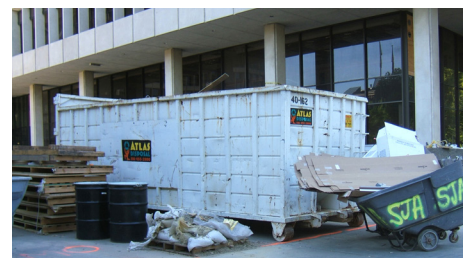
Recycling of construction waste in downtown Sacramento.

See PHS 3, Hazardous Materials, for additional policies on hazardous waste.