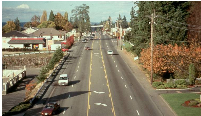
The photographs to the left illustrate an area where overhead utility lines (top) were undergrounded (bottom).

U 1.1.11 Underground Utilities. The City shall require undergrounding of all new publicly-owned utility lines, encourage undergrounding of all privately-owned utility lines in new developments, and work with electricity and telecommunications providers to underground existing overhead lines. (RDR/IGC)