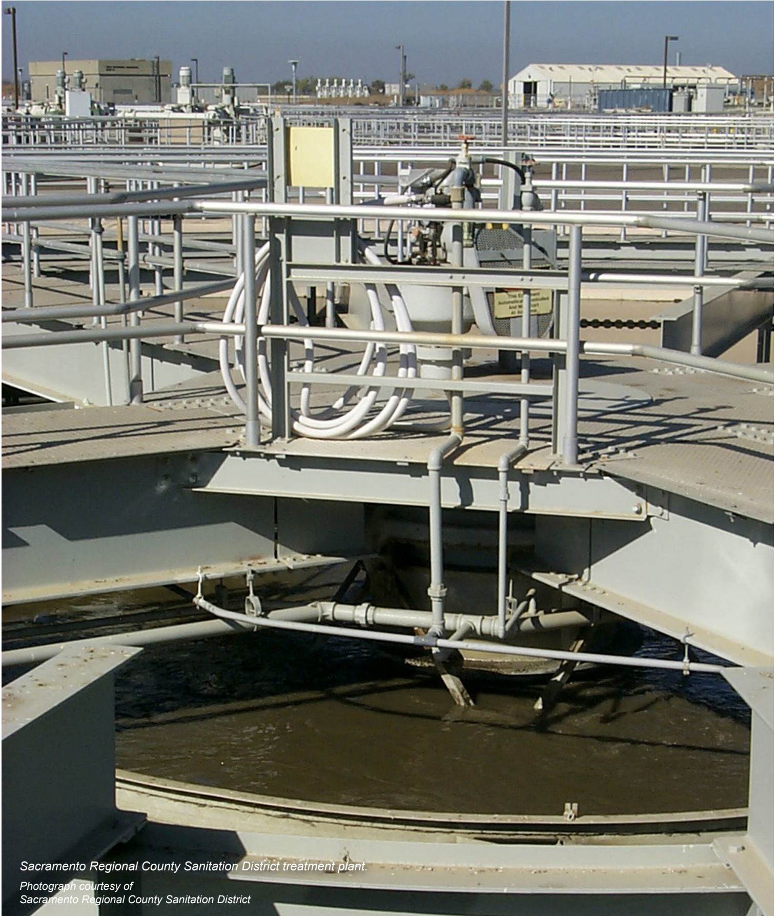
Sacramento Regional County Sanitation District treatment plant.