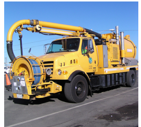
Vactor trucks efficiently collect waste and sediment from catch basins and manholes.

U 4.1.3 Regional Stormwater Facilities. The City shall coordinate efforts with Sacramento County and other agencies in the development of regional stormwater facilities. (IGC)