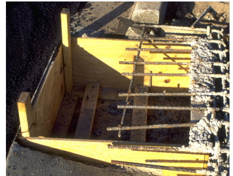
Construction of a stormwater drainage facility with curb and gutter.

U 4.1.1 Adequate Drainage Facilities. The City shall ensure that all new drainage facilities are adequately sized and constructed to accommodate stormwater runoff in urbanized areas. (MPSP/RDR)