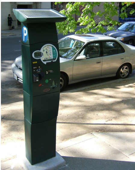
A parking meter that is powered by solar energy.

See ED 1, Business Climate, for additional policies on attracting new businesses.