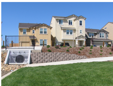
Joint use stormwater drainage/detention facility in conjunction with a park.

Infrastructure Finance. The City shall develop and implement a financing strategy and assess fees to construct needed water, wastewater, stormwater drainage, and solid waste facilities to maintain established service levels and to mitigate development impacts to these systems (e.g., pay capital costs associated with existing infrastructure that has inadequate capacity to serve new development). The City shall also assist developers in identifying funding mechanisms to cover the cost of providing utility services in infill areas. (MPSP/FB)