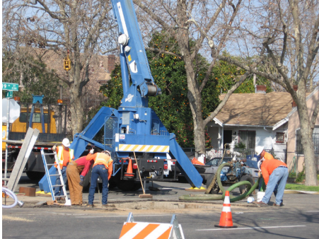
Workers repairing underground utility infrastructure.