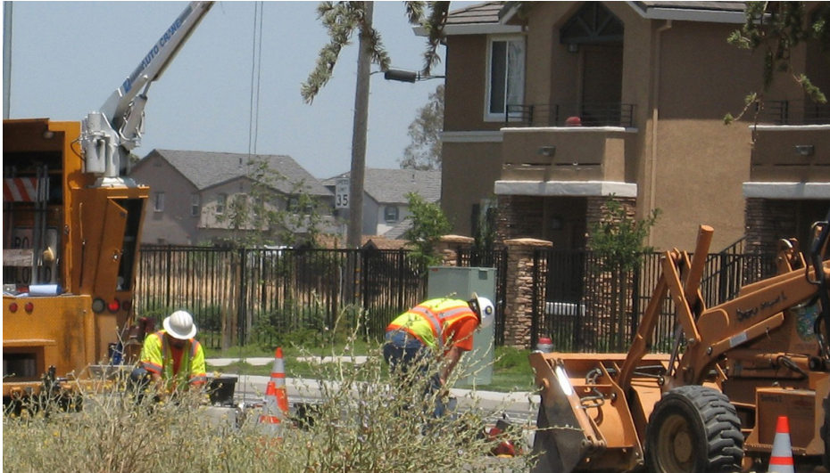
City utility workers providing infrastructure improvements in Natomas.

Policies in this section provide for high-quality and efficient utility services throughout the city. A level of service for all utilities will be established and utilities will be managed to meet the established level of service. Utility policies promote sustainability and seek to limit impacts to environmentally sensitive areas.