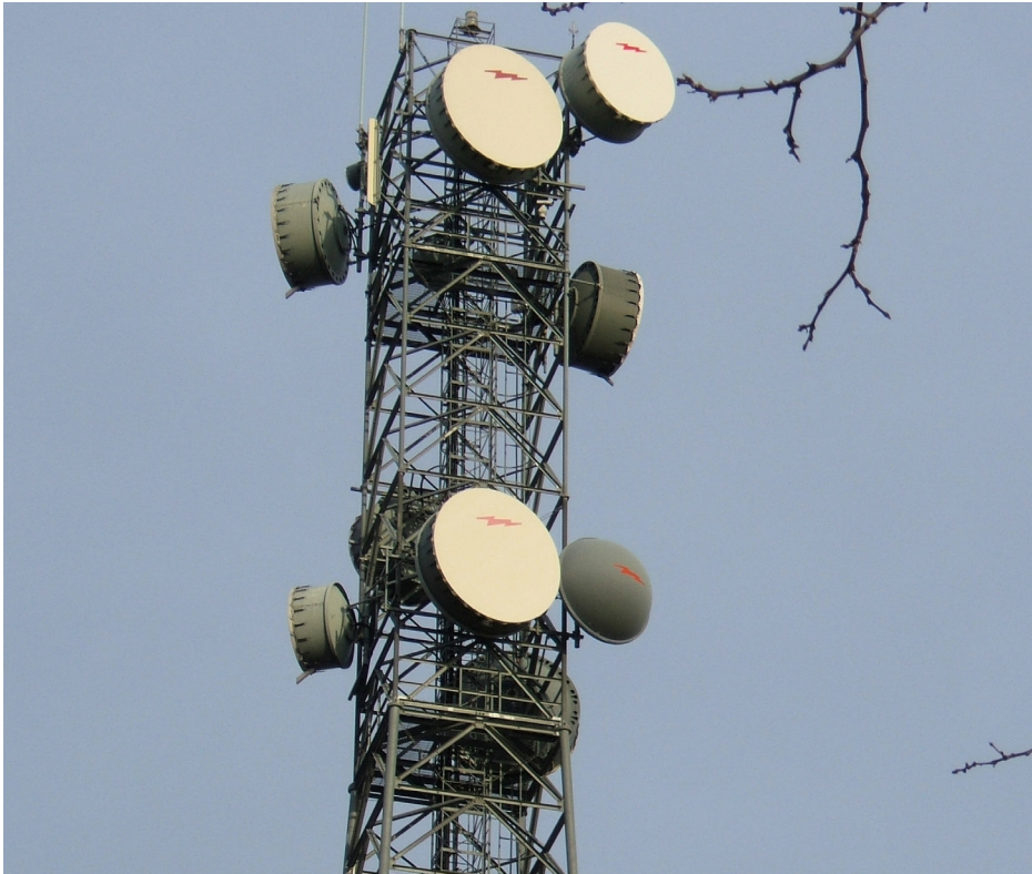
Telecommunications tower in the Richards Boulevard area, north of downtown Sacramento.

Policies in this section provide a wide range of innovative systems and services to attract and retain state-of-the-art businesses citywide, provide access to all residents, and facilitate public education. Telecommunication systems will be incorporated into public buildings and services, as well as into large-scale planned communities and office and commercial projects, to increase the accessibility of information. Telecommunication infrastructure will be designed to be compatible with adjacent uses and to minimize visual impacts.