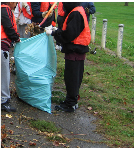
High school-age volunteers during a neighborhood clean up day.