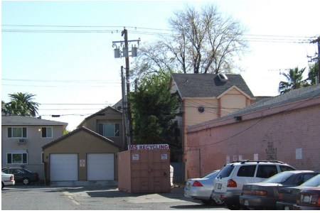
A recycling center facility that is compatible with the surrounding residential and commercial neighborhood uses.