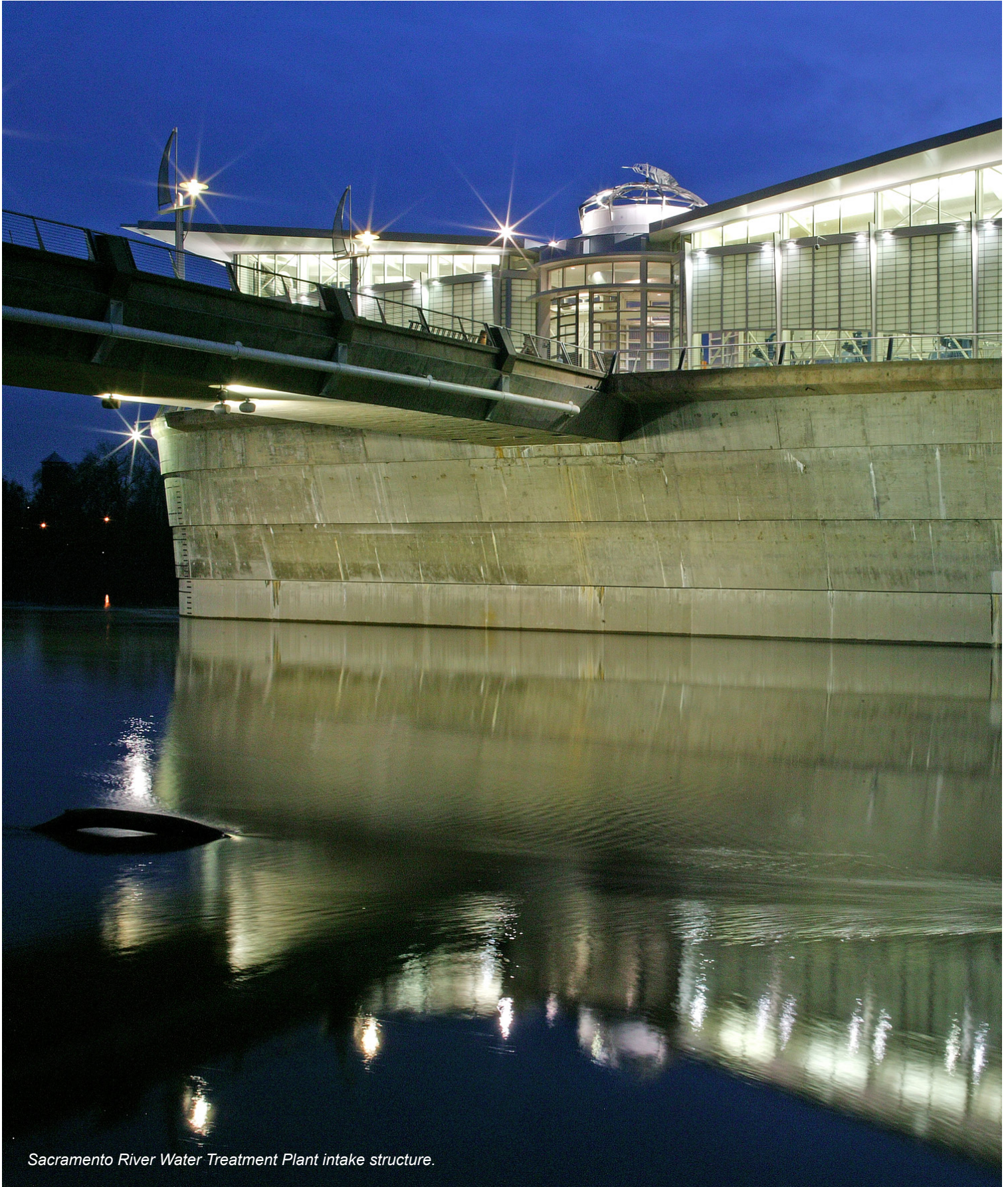
Sacramento River Water Treatment Plant intake structure.