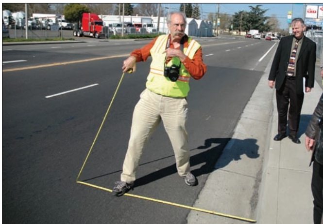
Figure 1.4 Walkability expert Dan Burden spent two days with staff surveying and advising staff and stakeholders on pedestrian-friendly street design.