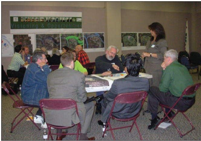
Figure 1.2 Working session of public workshops held in February and March of 2008.