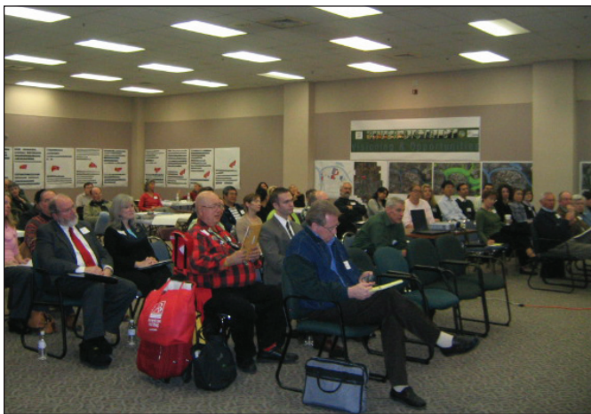
Figure 1.3 The 2008 Visioning Public Workshops were well attended and urban design concepts were presented with early Guiding Principals.