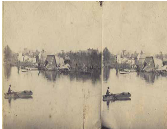
Figure 290. Photograph taken from the R Street levee during the flood of 1862 (1862).

When it opened in 1856, the Sacramento Valley Railroad's route was the first rail line in California. The 22-mile route stretched from the Sacramento Valley Railroad depot on the waterfront at Front Street, south along the Sacramento River, and then east along R Street to Folsom (then known as Granite City). The route was surveyed by Theodore Judah, who later helped complete the first transcontinental railroad as chief engineer of the Central Pacific Railroad. 2 The Central Pacific Railroad purchased the Sacramento