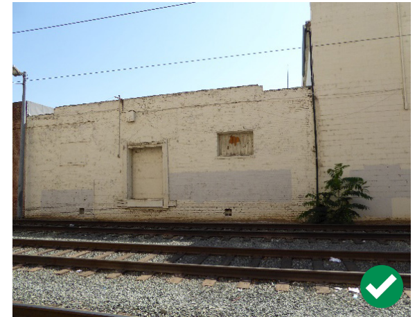
Figure 297. Historic loading bays convey the character of the district as a historic transportation corridor.