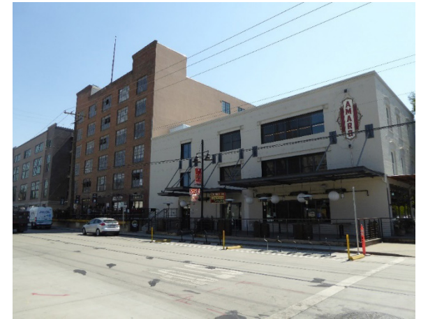
Figure 287. Buildings that served as warehouses and distribution centers, including the Lawrence Warehouse (middle) and Rochdale building (right), are common on R Street. The building on the far left is the Warehouse Artist Lofts, a recent housing infill development project.