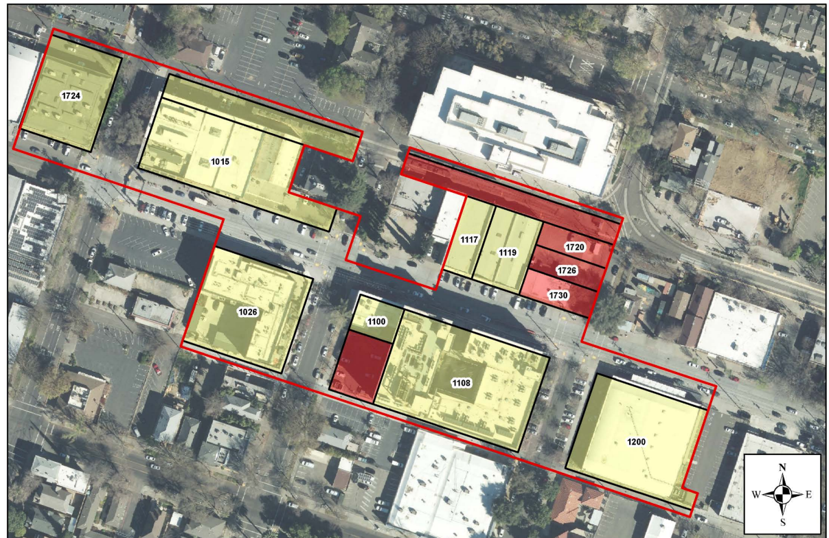
Figure 293. Map of the R Street Historic District.

The following map shows the boundaries and location of the R Street Historic District.