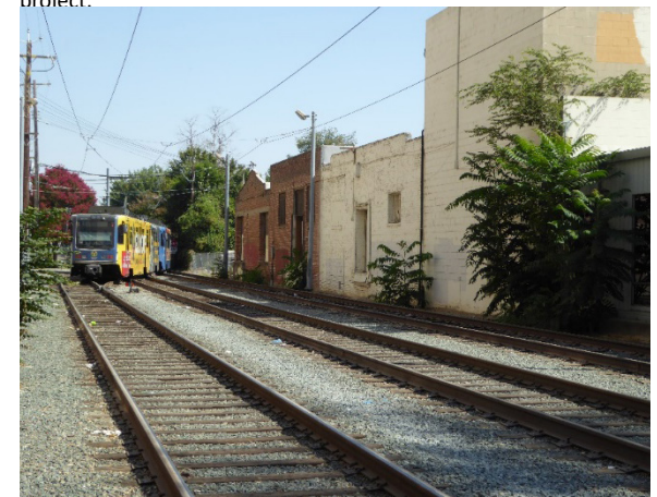
Figure 289. Loading docks face the former route of the Western Pacific Railroad tracks, which were converted for light rail service in 1987.