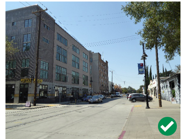
Figure 296. Increased building heights and masses are appropriate next to contributing buildings that are taller and larger in scale.