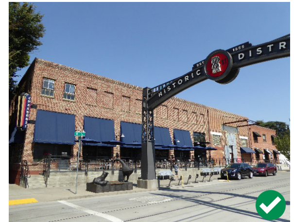
Figure 295. A loading platform at 1001 R Street is used to provide restaurant seating and access to the building.