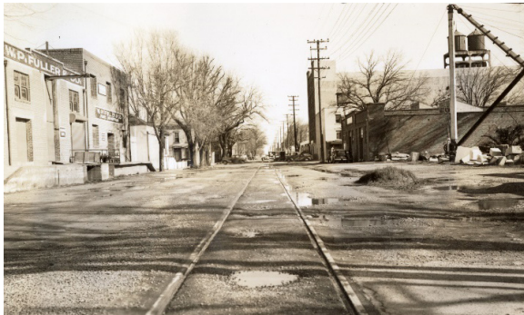
Figure 291. View of R Street, looking east from 10th Street with the W.P. Fuller Company warehouse on the left and Carlaw Bros. Stoneyard on the left (1941).