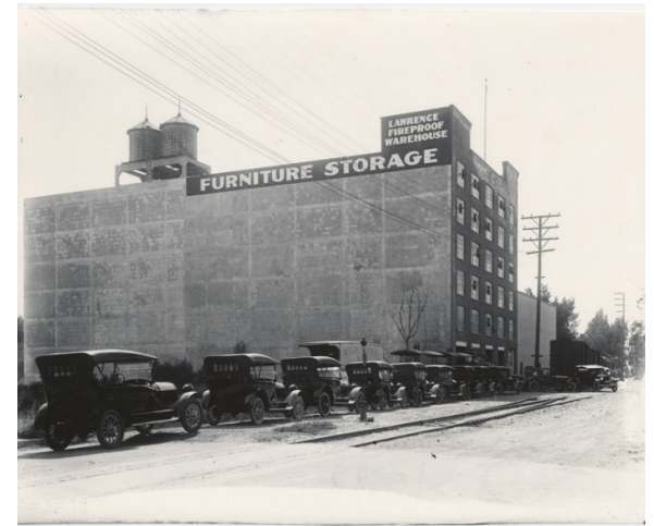
Figure 292. View of the Lawrence Warehouse from 11th and R streets with a line of cars parked next to the railroad tracks (1915).

R Street has experienced a significant revitalization in the twenty-first century, transforming into one of Sacramento's most vibrant commercial and recreational corridors. Many of the former industrial buildings in the area have been rehabilitated and are occupied by restaurants and local businesses. In 2015, the Lawrence Warehouse building reopened as the Warehouse Artist Lofts, a mixed-use apartment complex with 116 affordable housing units marketed to members of Sacramento's artist community. 7