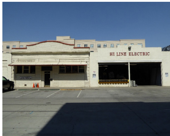
Figure 288. Two brick One-Part Commercial Block buildings with garage door openings along R Street.