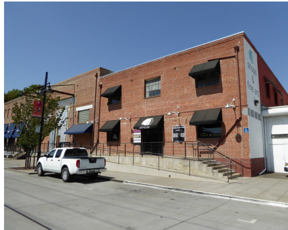
Figure 286. Adaptively reused warehouses and industrial buildings on R Street.

The R Street Historic District is located in Sacramento's original 1848 street grid, approximately four blocks south of the State Capitol. The district consists of former warehousing, commercial distribution, and light industrial buildings that are situated along R Street between 10 th Street to the west, Quill Alley to the north, 12 th Street to the east, and Rice Alley to the south.