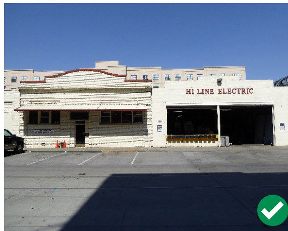
Figure 294. Buildings are typically oriented to R Street and have window and door openings that face the street.