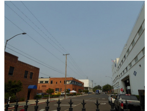
Figure 88. Industrial and administrative buildings built for the California Almond Growers Exchange (now Blue Diamond Growers) are still in operation along C Street.