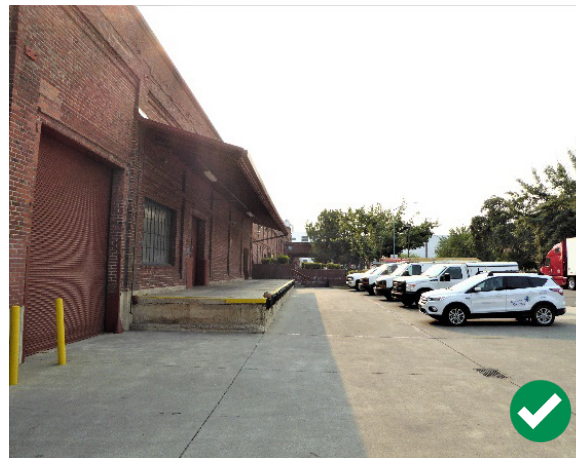
Figure 94. Shed awnings and loading platforms are common in the district.