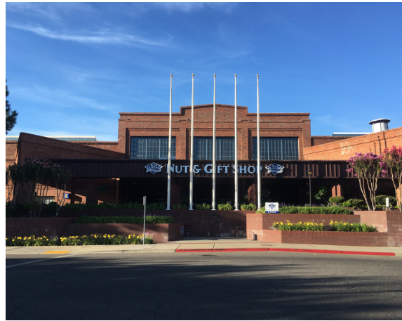
Figure 87. The former Calpak No. 11 cannery is now part of the Blue Diamond Growers' complex on C Street.

The C Street Industrial Historic District is located along the northern edge of Sacramento's original 1848 street grid and is roughly bounded by 16 th Street and Muir Park to the west, the railroad tracks to the north, 19 th Street to the east, and C Street to the south. The district incorporates a collection of industrial buildings that were constructed for the California Almond Growers Exchange (now Blue Diamond Growers) and California Packing Company from the early to mid-twentieth century.