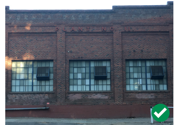
Figure 92. Historic multi-lite steel frame windows contribute to the character of the historic district.