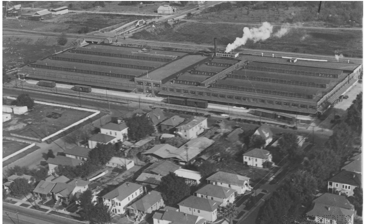
Figure 90. An aerial view of the California Packing Company's plant in 1932, looking north from C Street with 16 th Street on the left and the Southern Pacific tracks on the B Street levee behind (1932).

Blue Diamond continues to operate as an active almond processing plant at its original location along C Street, making it the oldest agricultural cooperative in California and one of the state's most successful agricultural businesses. 14 The facilities occupy about 11 city blocks north of Sacramento's midtown area