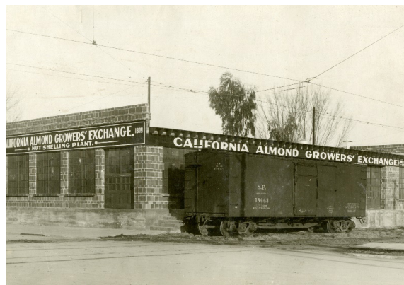
Figure 89. California Almond Growers Exchange nut shelling plant served by a spur track of the Southern Pacific Railroad (ca. 1914).

the Southern Pacific railroad tracks at the intersection of C and 18 th streets. 3 Parcels to the immediate north, east, and west remained largely undeveloped, while those to the south were primarily filled with the modest single-family houses and multi-family flats of a working-class residential neighborhood where employees of the area's major industries settled. 4