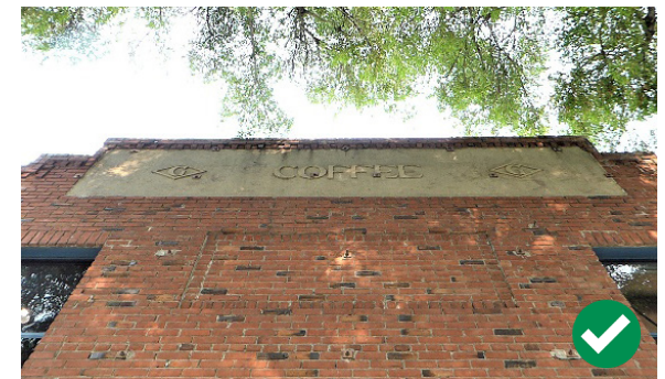
Figure 93. Historic signage survives on several buildings in the district.