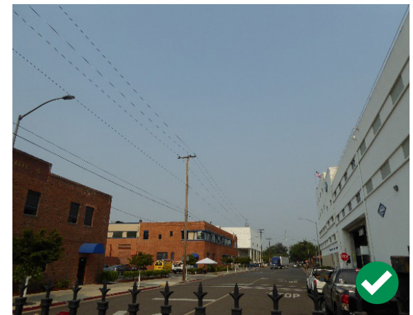
Figure 95. Contributing buildings in the historic district exhibit a variety of heights and sizes