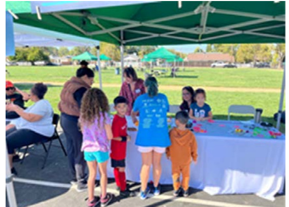
Spotlight on Stockton at Donner Field.