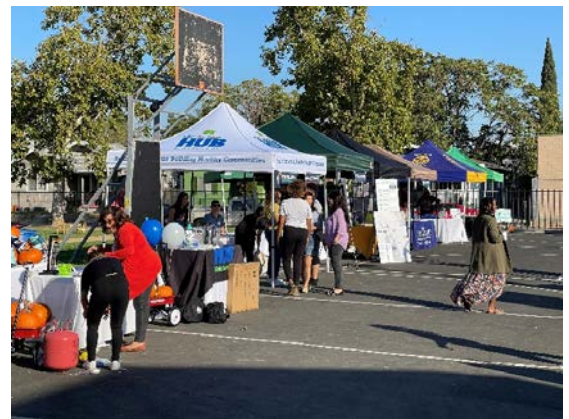
Spotlight on Stockton at Donner Field.