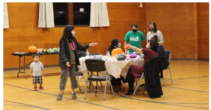
Multilingual Night at Will C. Wood Middle School (September 22nd). The engagement team hosted a multilingual night at Will C. Wood Middle School. Food and raffle prizes were provided at the event, which was attended by 13 community members.