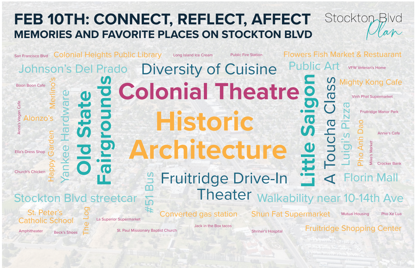
Figure A-6. Mural Board of Visioning Breakout Room Exercise