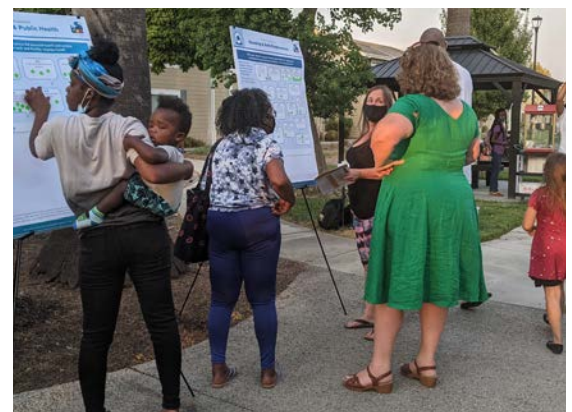
Pop-Up at the Greenway Mutual Housing Apartments