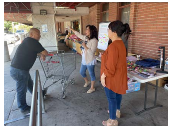
Community members discuss the plan at a grocery store pop-up.