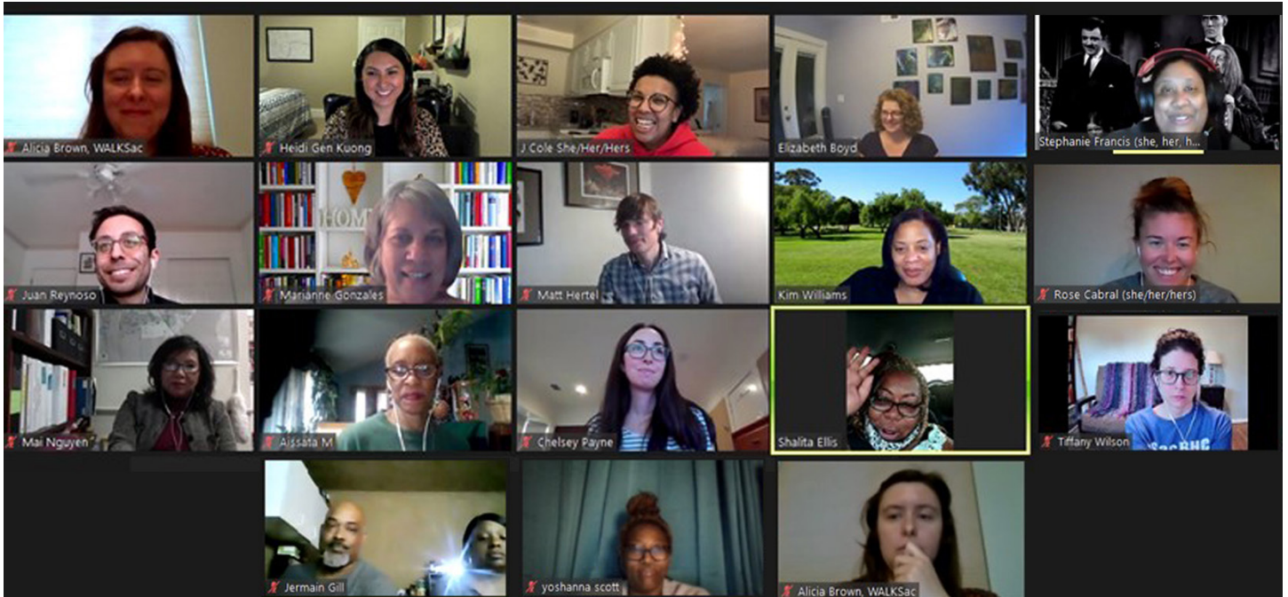
Figure A-1. Screenshot of October 2021 RPT Meeting

The Engagement Team also coordinated community engagement events with the RPT to ensure engagement activities were planned and implemented in a way that was most effective and culturally appropriate, with a goal of reaching traditionally underrepresented groups. The RPT played a large role in the first Community Workshop. Figures A-2 and A-3 show the results of the visioning and favorite memories and places exercises done with the RPT in advance of the first Community Workshop.