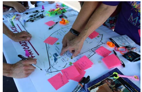
Residents point out their favorite places along the corridor.