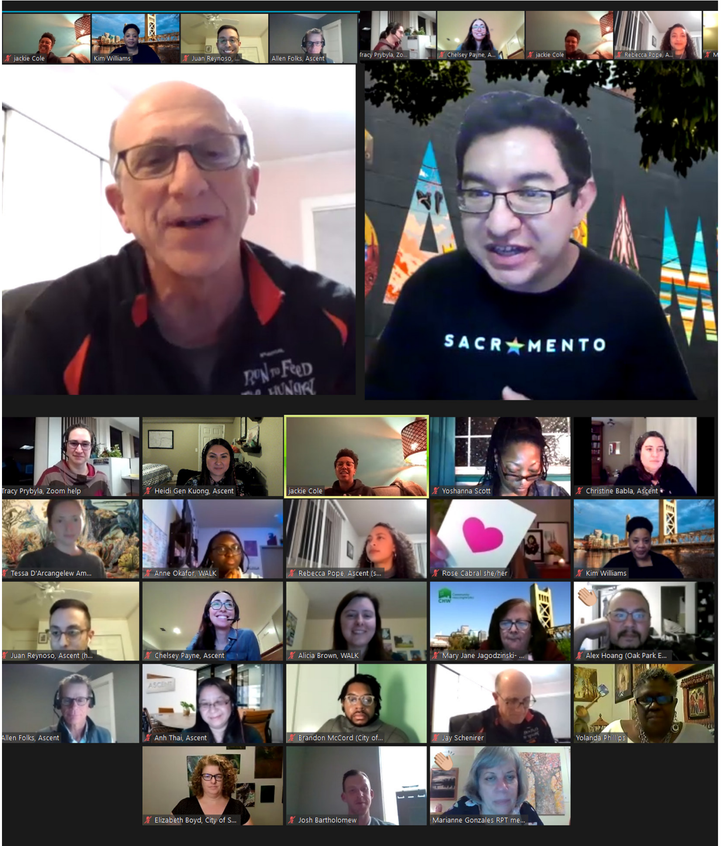
Figure A-4. Screenshots from the Stockton Blvd Plan: Connect, Reflect, Affect Event in February 2021