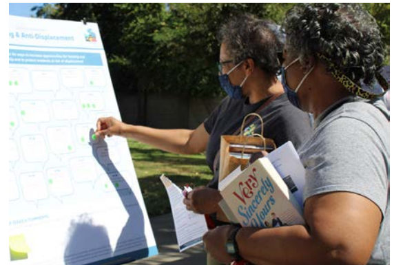
Pop-Up at the Colonial Heights Library