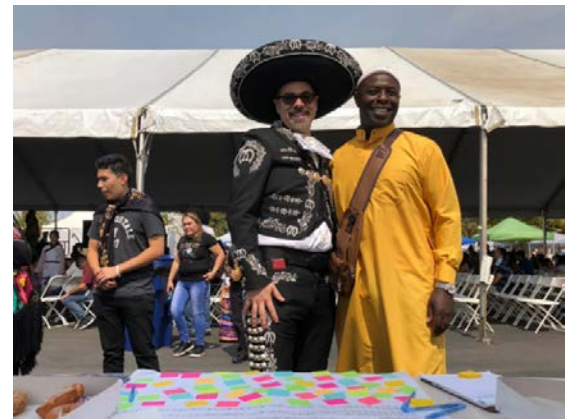
Community members celebrating at Little Saigon Plaza.