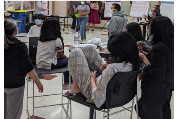
Pop-Up at Lemon Hill Mutual Housing Apartments

At the pop-up events, the engagement team, including Spanish, Chinese/Mandarin, Vietnamese interpreters, facilitated informal conversations around storytelling, placemaking, and anti-displacement. A diverse range of participants, terms of age (children to older adults), race, language, housing status, geographic location (e.g., residents who live adjacent to Stockton Boulevard vs. residents who live elsewhere but frequently come to Stockton Boulevard for school, shopping, work, etc.), and time spent living in the area, engaged in conversations. Participants shared their stories, and how they came to live and work along the corridor, citing its affordability and ethnic diversity. Expressed concerns included crime and safety issues, an increase in homelessness, and an increase in cost-of-living expenses. They also shared solutions, such as bringing more family-serving businesses to the area, supporting residents with rental costs, increasing the variety of restaurants, enhancing the cultural events, improving the transportation network, and creating stronger relationships with the City.