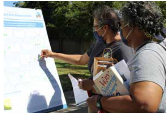
Pop-Up at the Colonial Heights Library