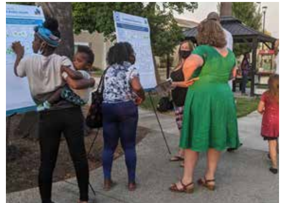
Pop-Up at the Greenway Mutual Housing Apartments