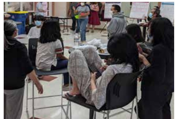
Pop-Up at Lemon Hill Mutual Housing Apartments