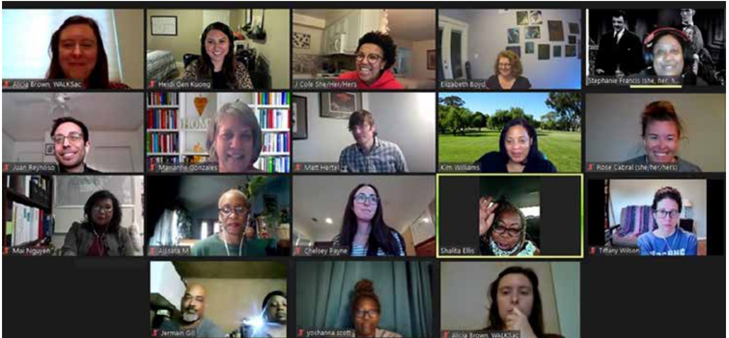
Figure A-1. Screenshot of October 2021 RPT Meeting

The Engagement Team also coordinated community engagement events with the RPT to ensure engagement activities were planned and implemented in a way that was most effective and culturally appropriate, with a goal of reaching traditionally underrepresented groups. The RPT played a large role in the first Community Workshop. Figures A-2 and A-3 show the results of the visioning and favorite memories and places exercises done with the RPT in advance of the first Community Workshop.