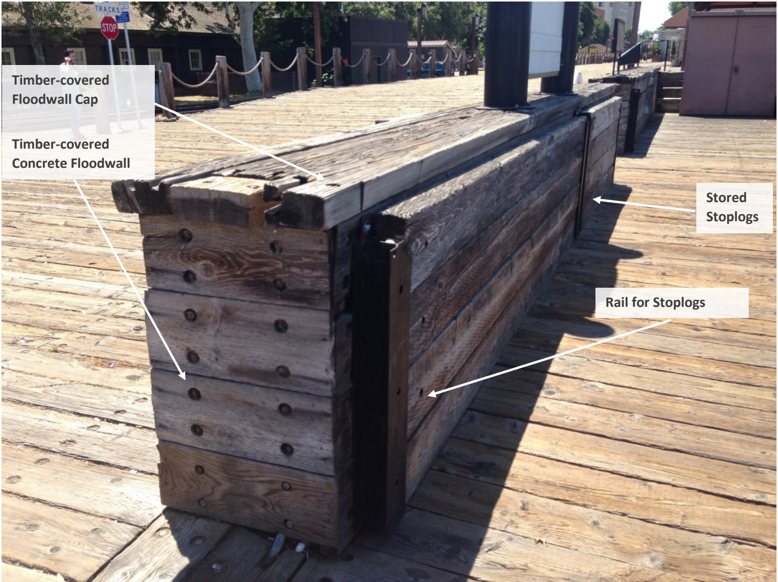
Existing Concrete Floodwall with Timber Fascia and Cap.