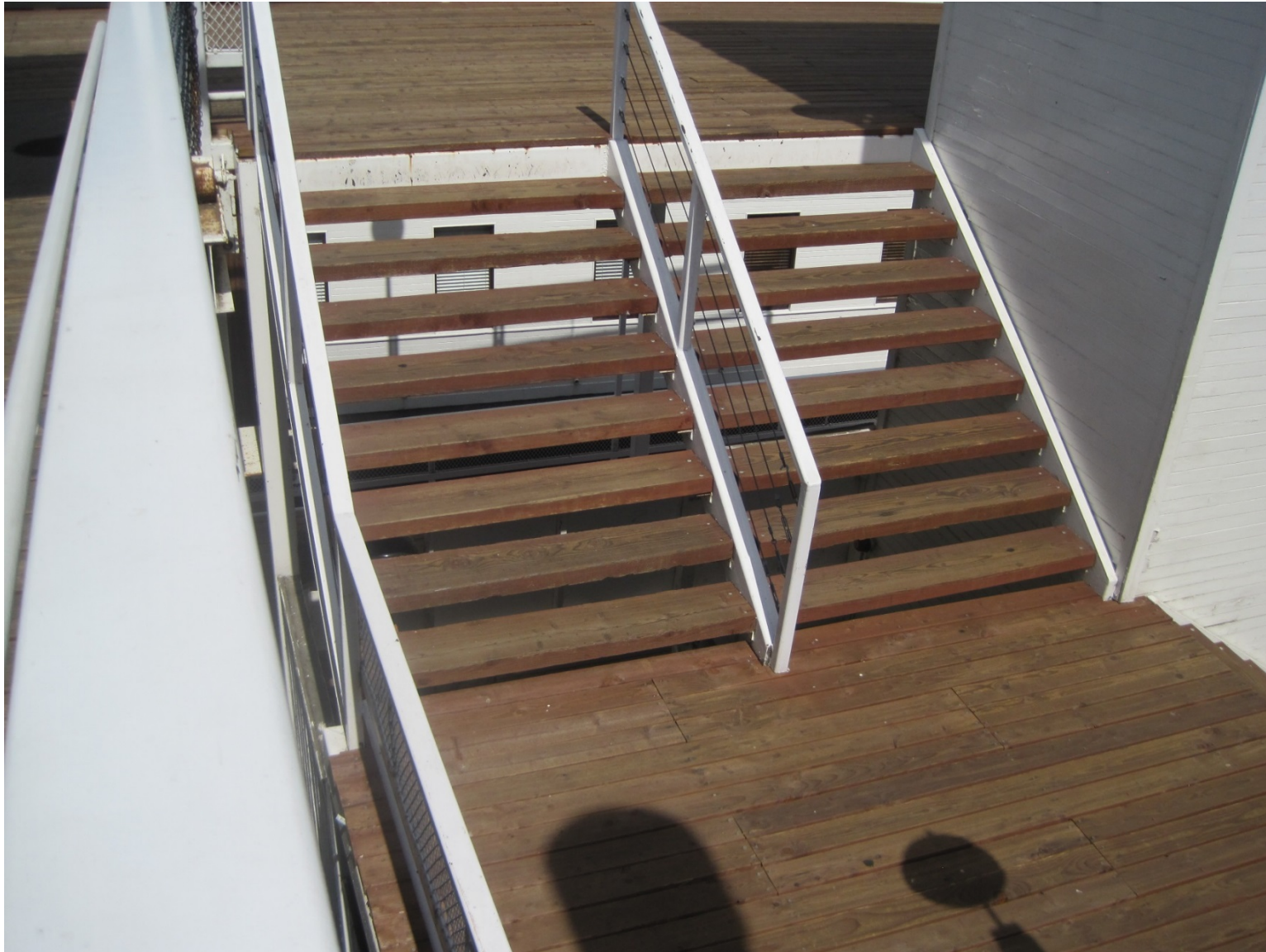
Current Condition of the Stairs.