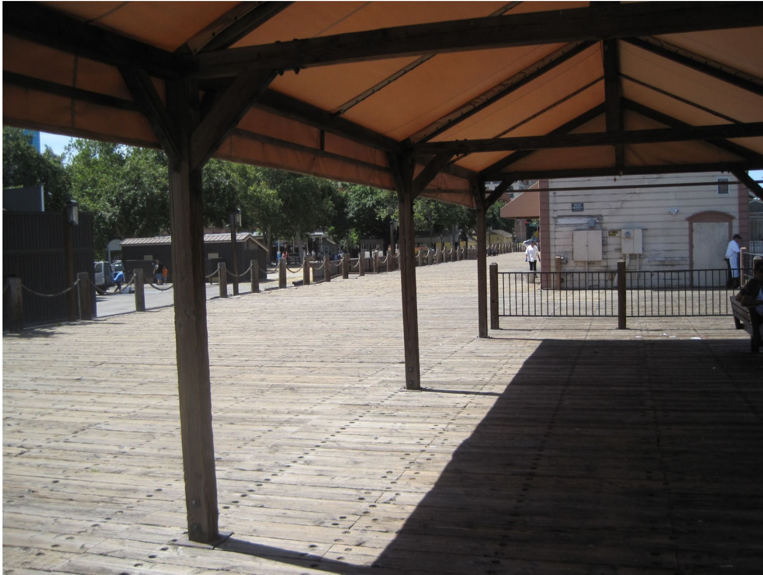
Shade Structure on the Embarcadero Showing Bolted Vertical Supports.