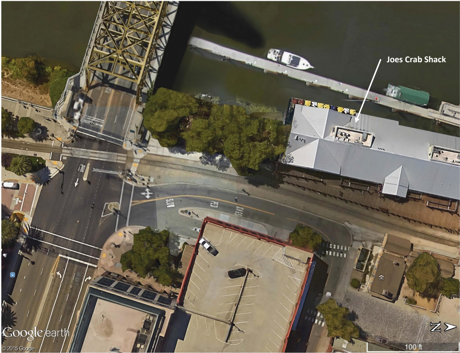
Downstream (south) Section of Project.