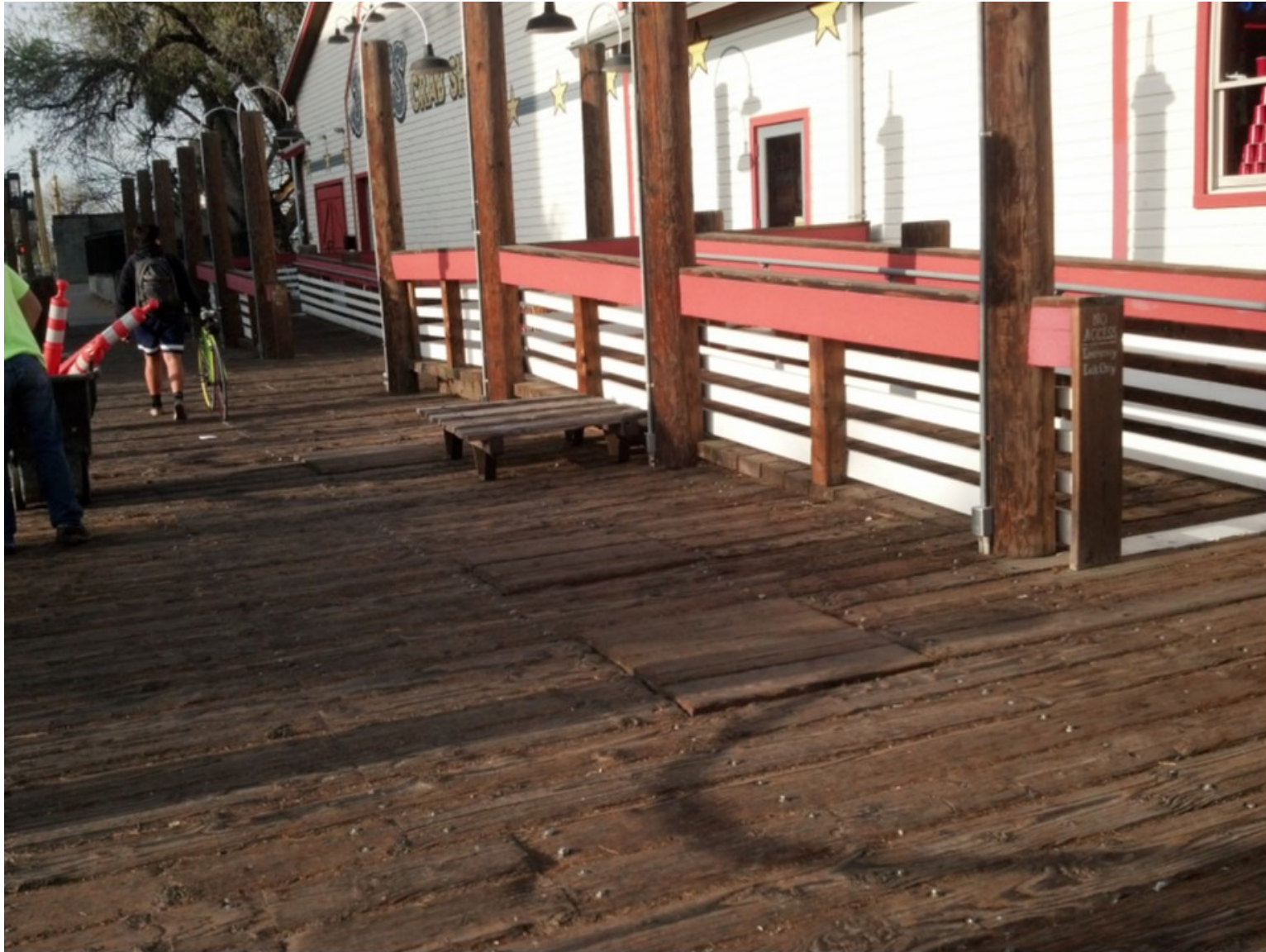
Joe's Crab Shack.