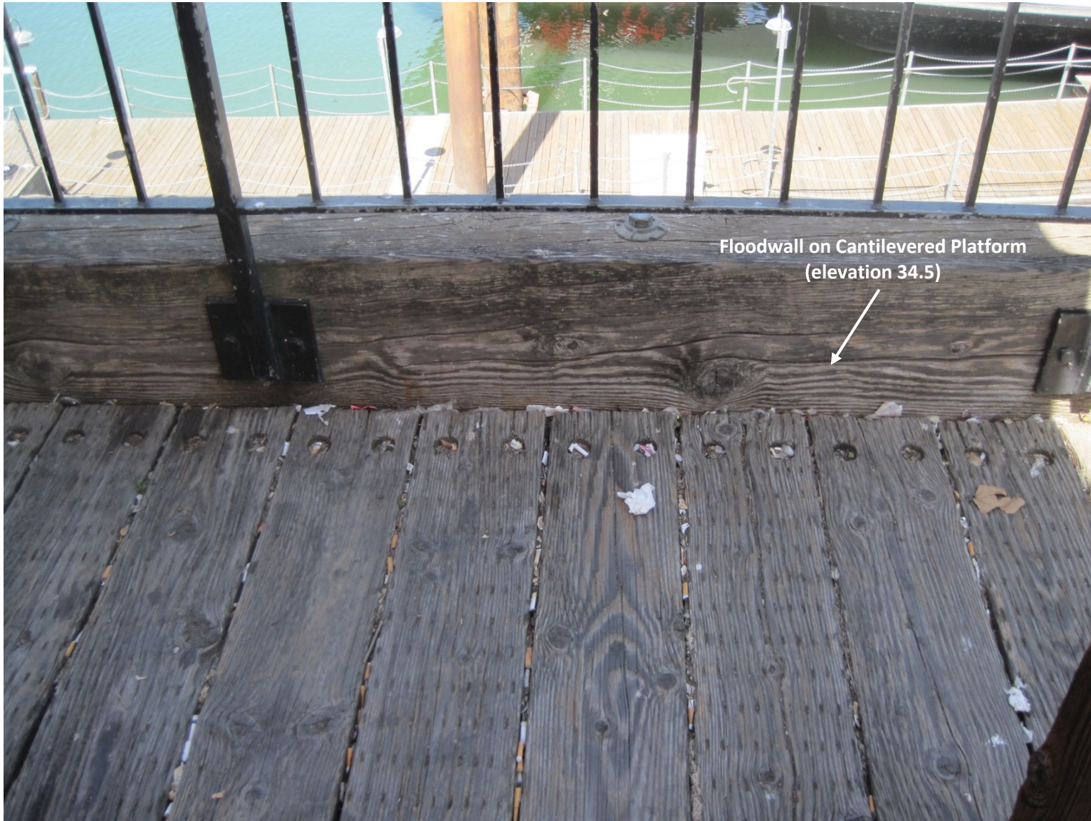
Timber Beam that Forms the Floodwall on the Elevated Embarcadero Sections.