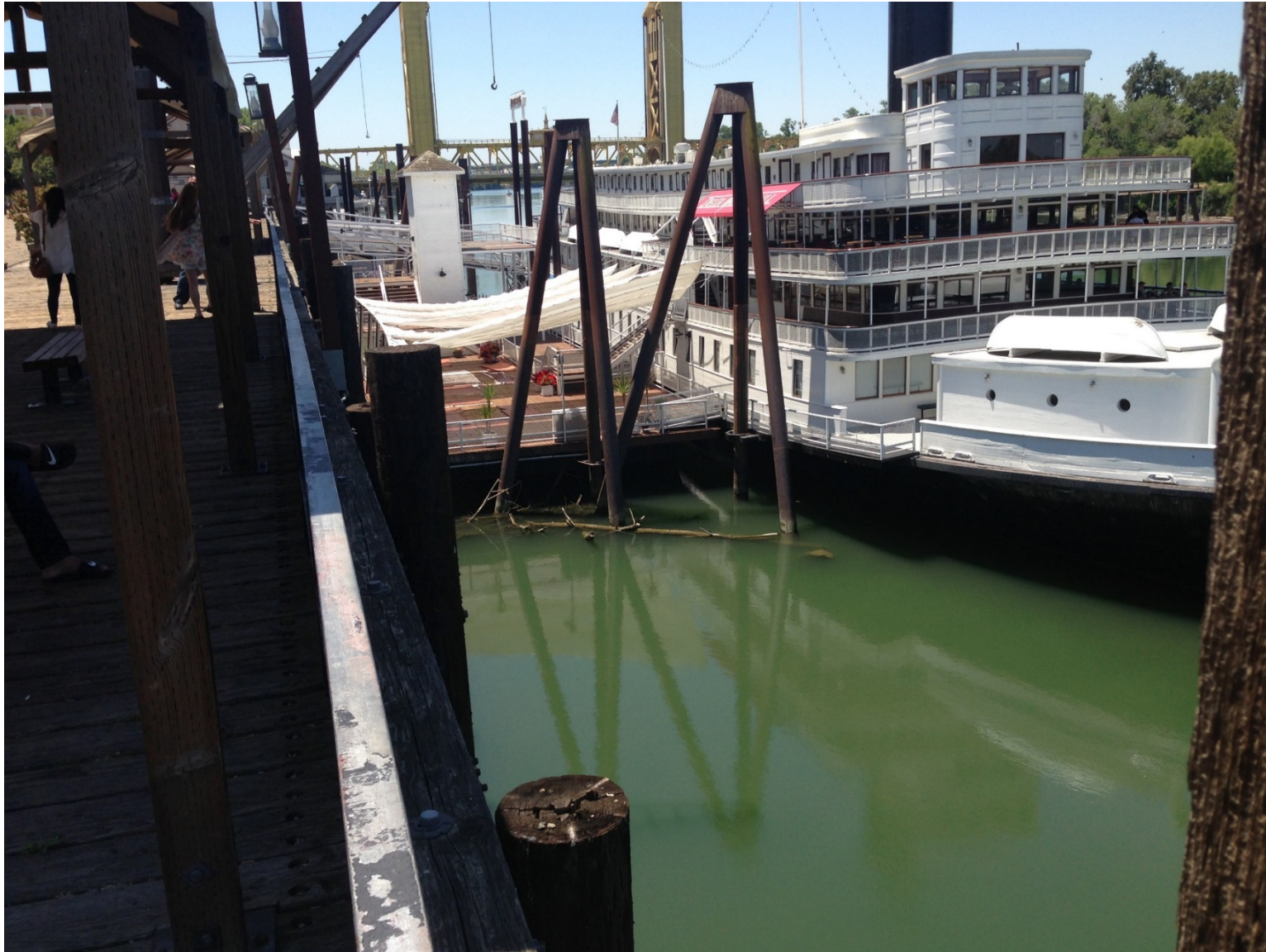
View of the Gangway and the Barge Facilities adjacent to the Delta King.