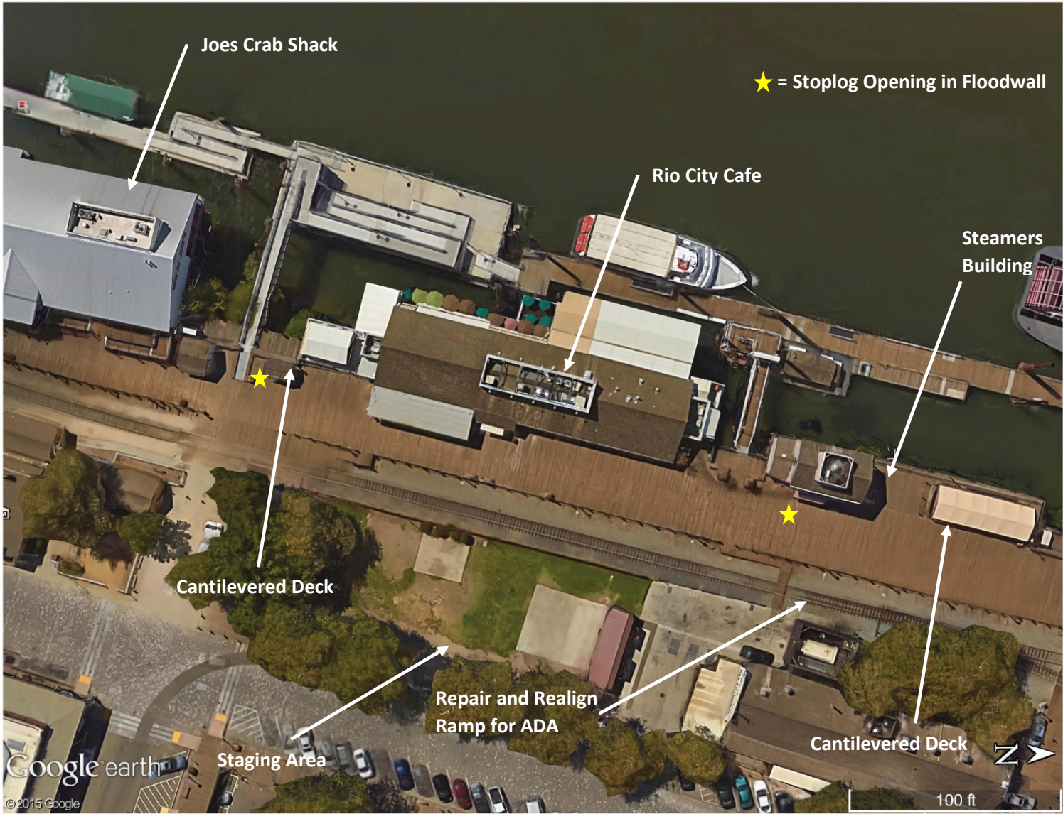
K Street Section of Project.