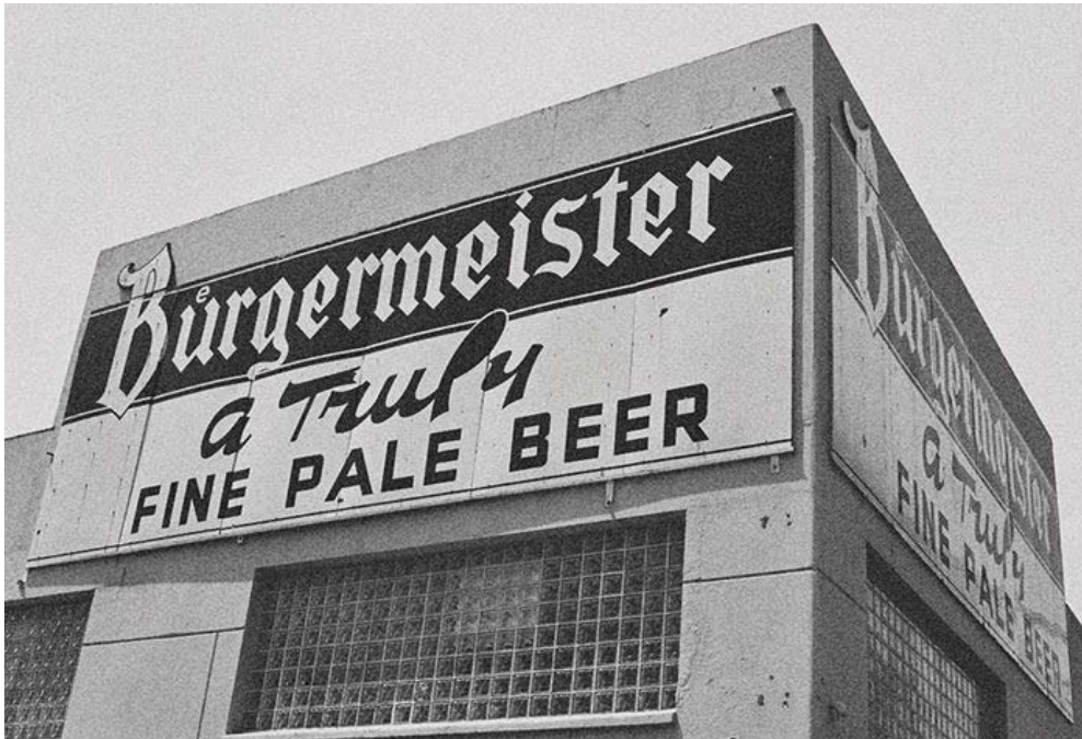
< Via saccanidist.com