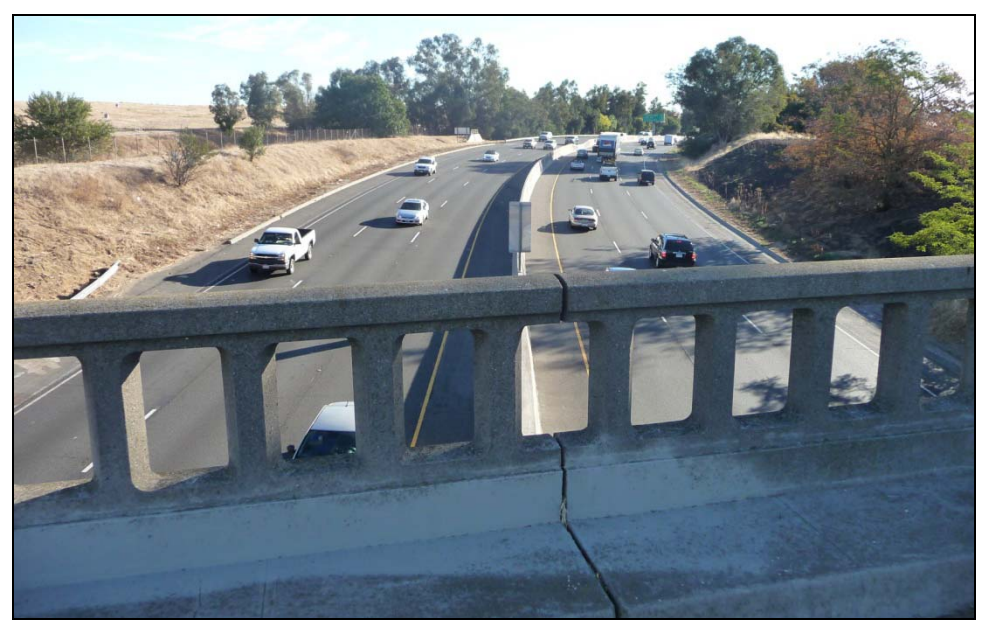
Photograph 2: A Street OC railing and view of freeway. B Street Underpass floodgates are in the background, 8/16/13.

oxed{oxed} Continuation oxed{\Box} Update