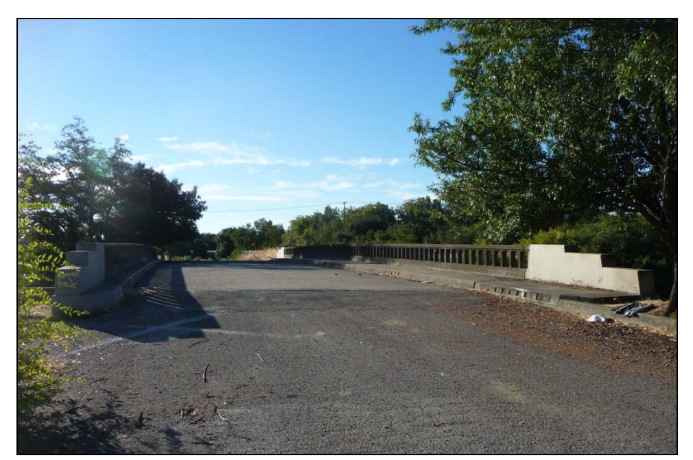
Photograph 1: A Street OC deck, camera facing east, 8/16/13.