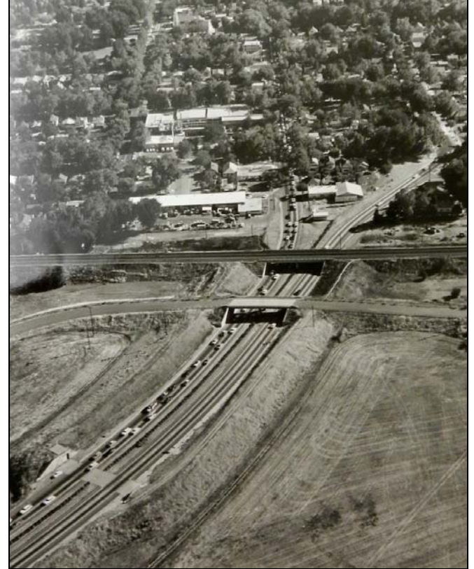
Photograph 4: A Street OC completed with Elvas Freeway, 1960.<sup>8</sup>