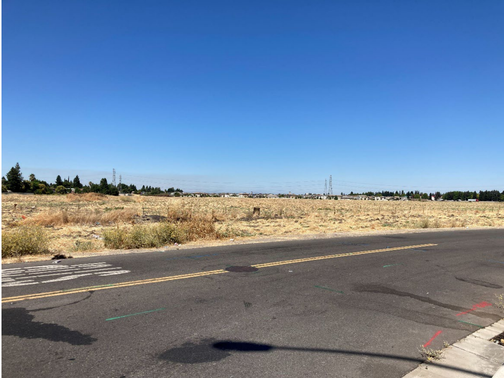
Photo 2d. View facing west from southern corner of the project site. Rosin Court is visible in the foreground, and the undeveloped parcels west of the project site are visible across the center of the photo. Existing residences 0.4-mile west of the project site are visible along the horizon. Photo date: 7/9/2025