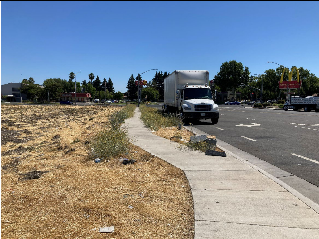
Photo 2c. View facing northeast along the southeastern project site boundary from the southern corner of the project site. Rosin Court is visible in the right side of the photo. Photo date: 7/9/2025