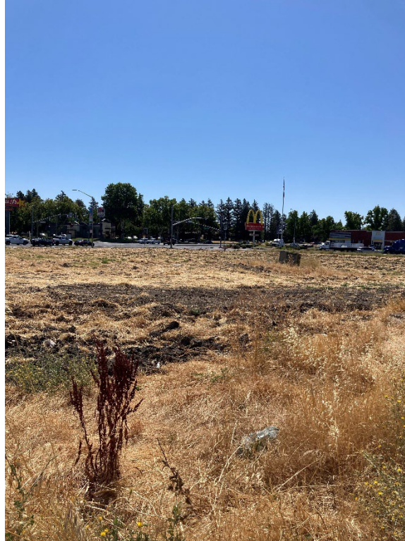
Photo 1. View of the project site facing southeast from the northwest corner of the project site. The site is undeveloped and disturbed. The surrounding development east of Northgate Boulevard and south of Rosin Court are visible in the background. Photo date: 7/9/2025