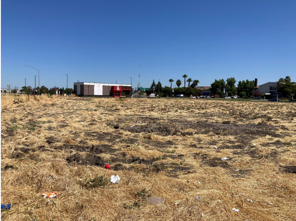
Photo 2b. View of the project site facing north from the southern corner of the project site. The project site is undeveloped and disturbed. The KFC restaurant northwest of the project site and other development east of Northgate Boulevard are visible in the background. Photo date: 7/9/2025