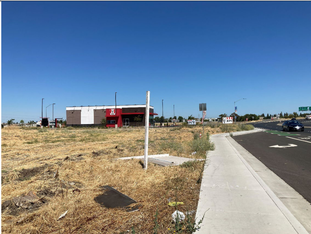
Photo 4b. View facing northwest along the northeastern project site boundary from the eastern corner of the project site. Northgate Boulevard is visible in the right side of the photograph. Photo date: 7/9/2025