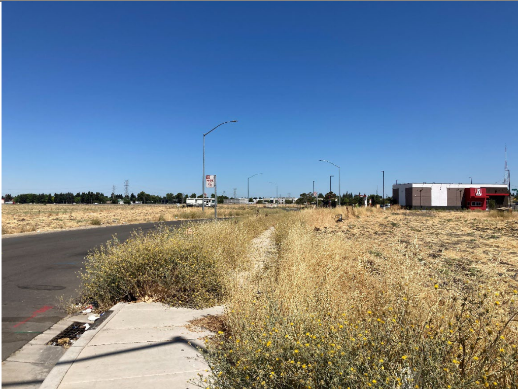
Photo 2a. View facing northwest along the western project site boundary from the southern corner of the project site. Rosin Court is visible in the left part of the photo. Photo date: 7/9/2025