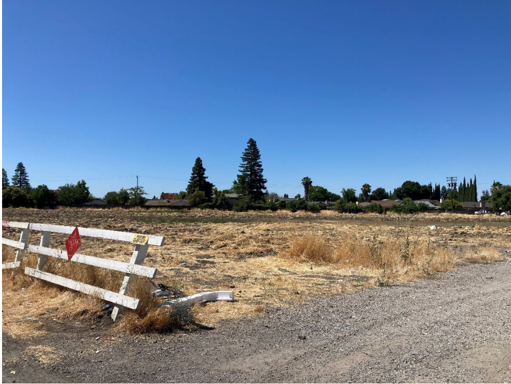
Photo 5. View facing south from southern corner of Rosin Court, south of the project site. The existing residences 500 feet south of the project site are visible. Photo date: 7/9/2025