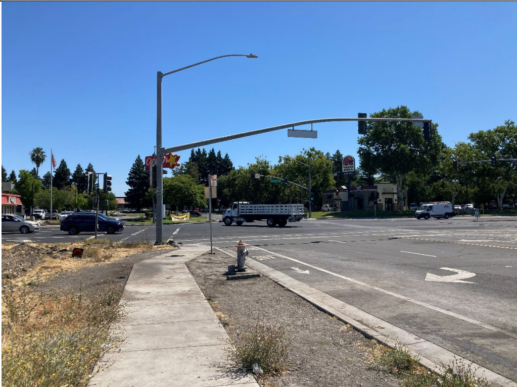
Photo 3. View facing northeast along southeast project site boundary. The intersection with Northgate Boulevard and Rosin Court and surrounding existing development are visible. Photo date: 7/9/2025