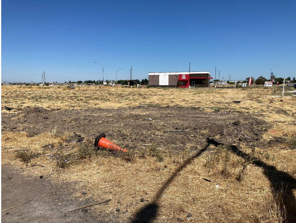
Photo 4a. View of the project site facing west from the eastern corner of the project site. The project site is undeveloped and disturbed. The KFC restaurant northwest of the project site is visible near the center of the photograph, and existing residences 0.4-mile west of the project site are visible in the background, left of the KFC restaurant. Photo date: 7/9/2025