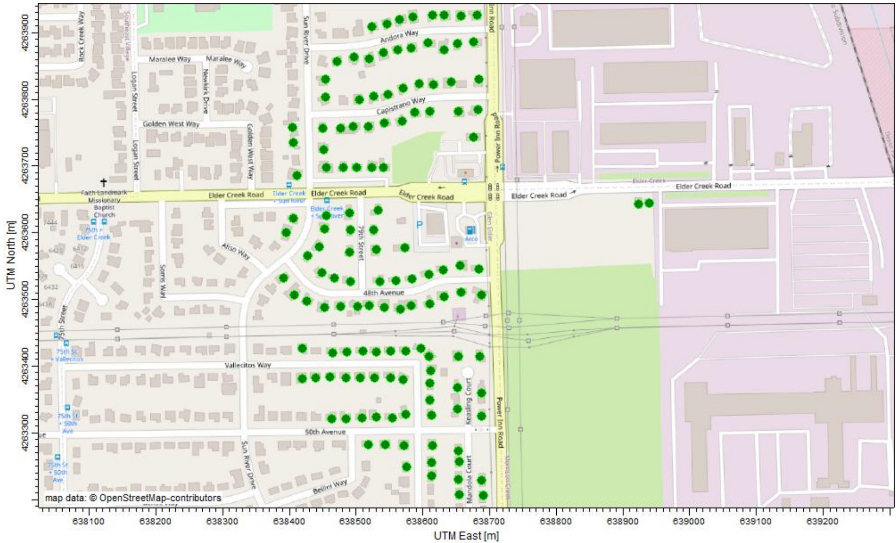
Figure B-1 Health Risk Assessment Sensitive Receptors