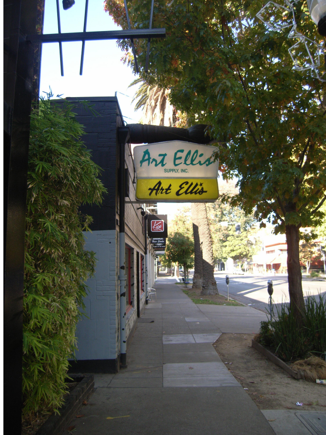
Photograph 2. Art Ellis sign, camera facing west