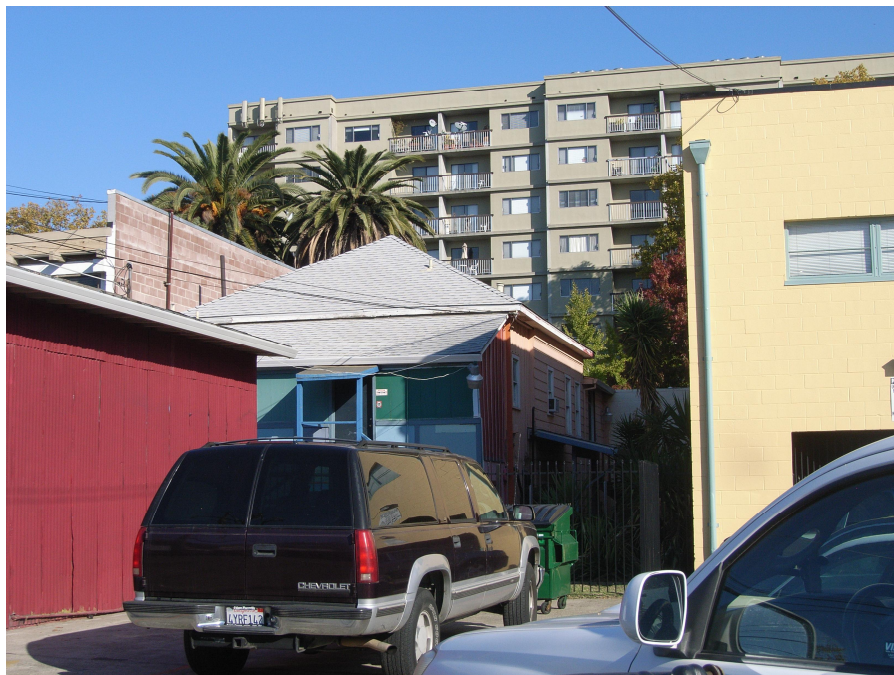
Photograph 4. 2508 J Street, camera facing northwest