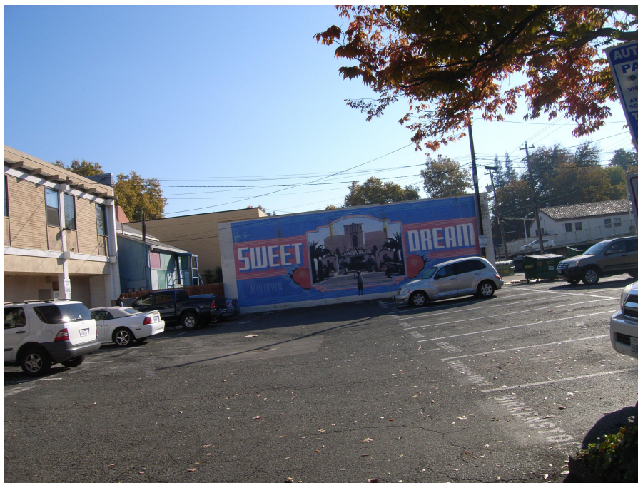
Photograph 6. Mural on Building 2, camera facing east