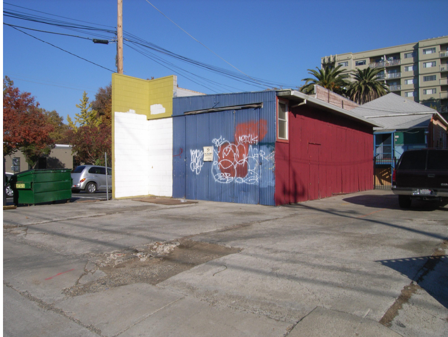
Photograph 5. Building 2, camera facing northwest