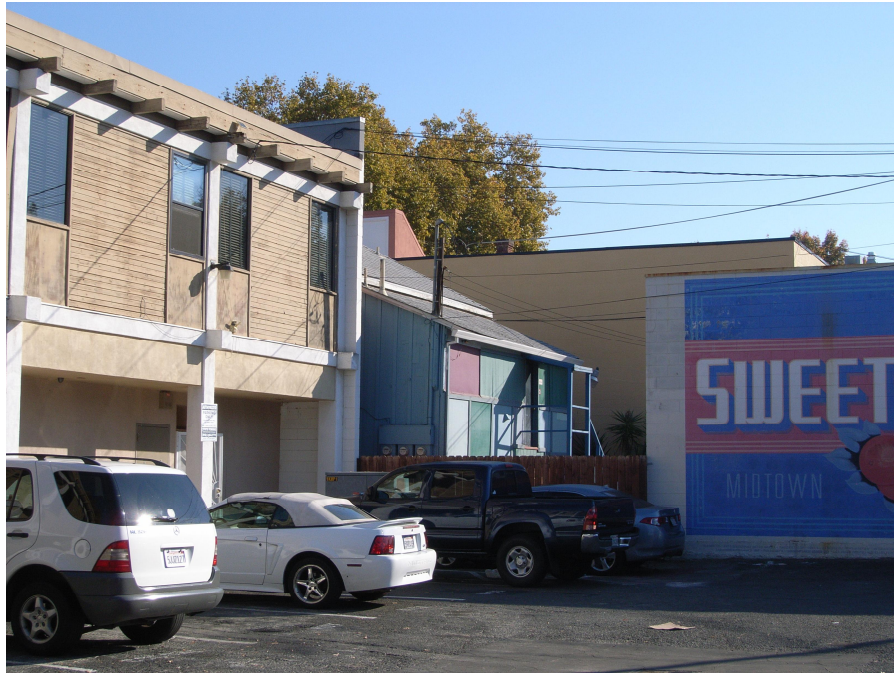
Photograph 3. 2508 J Street, south elevation, camera facing northeast