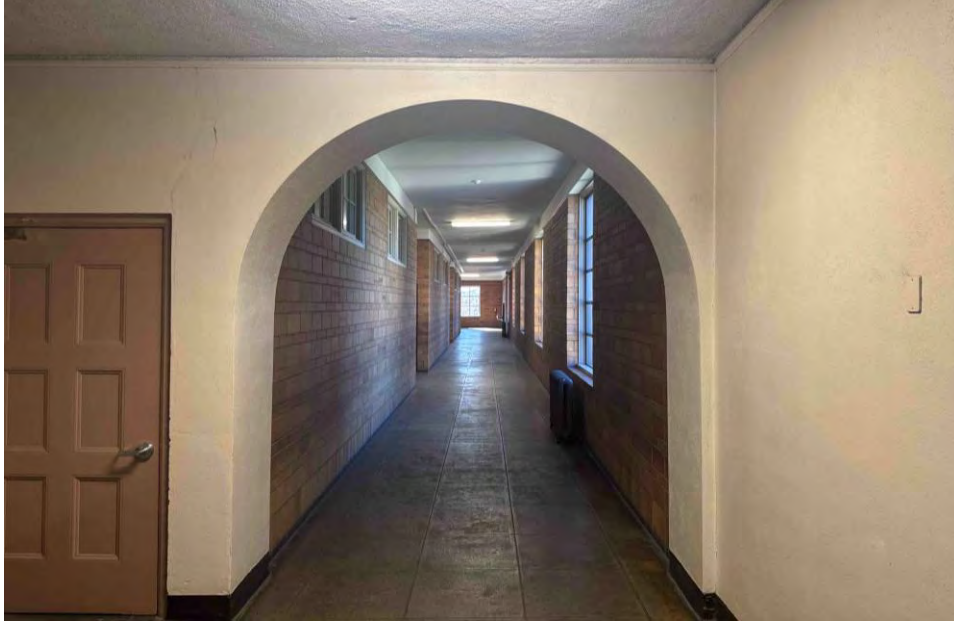
Photo 14 Auditorium lobby (first floor) interior, camera facing south