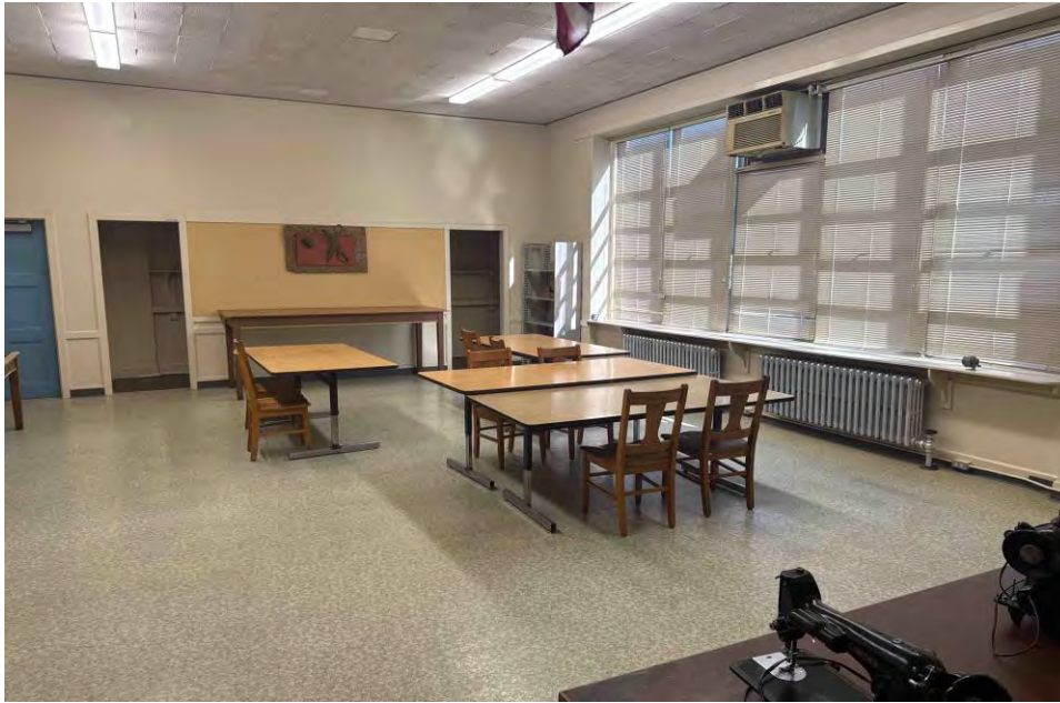
Photo 17 Classroom 10 (second floor) interior, camera facing northeast