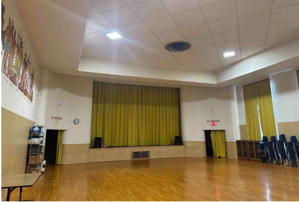
Photo 16 Auditorium (first floor) interior mural, camera facing northeast