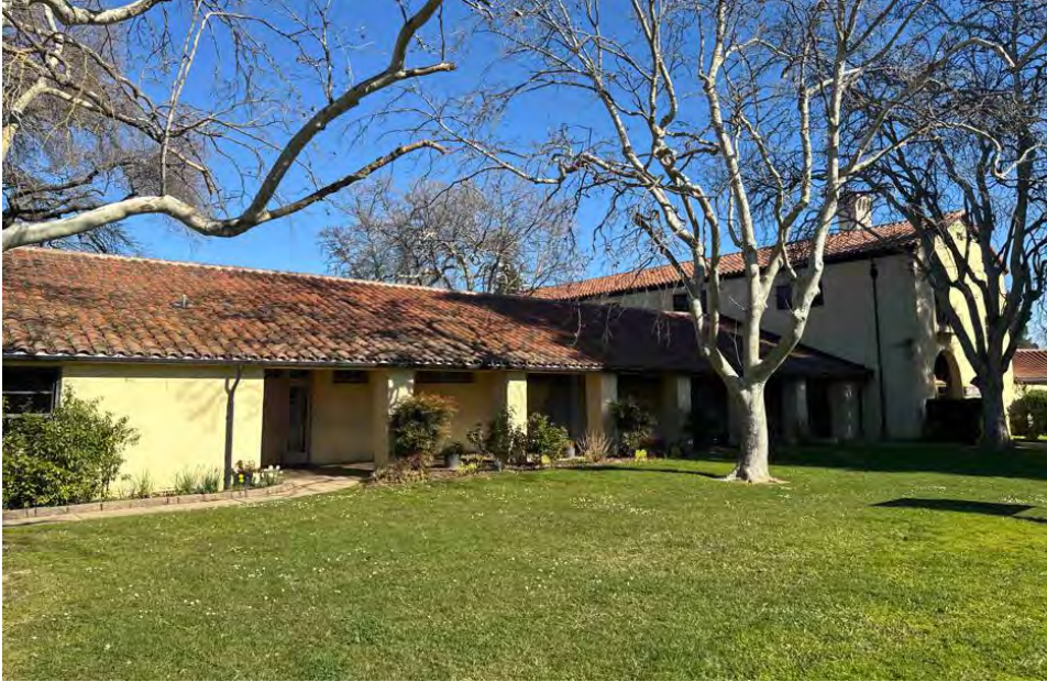
Photo 4 Arcade, camera facing west