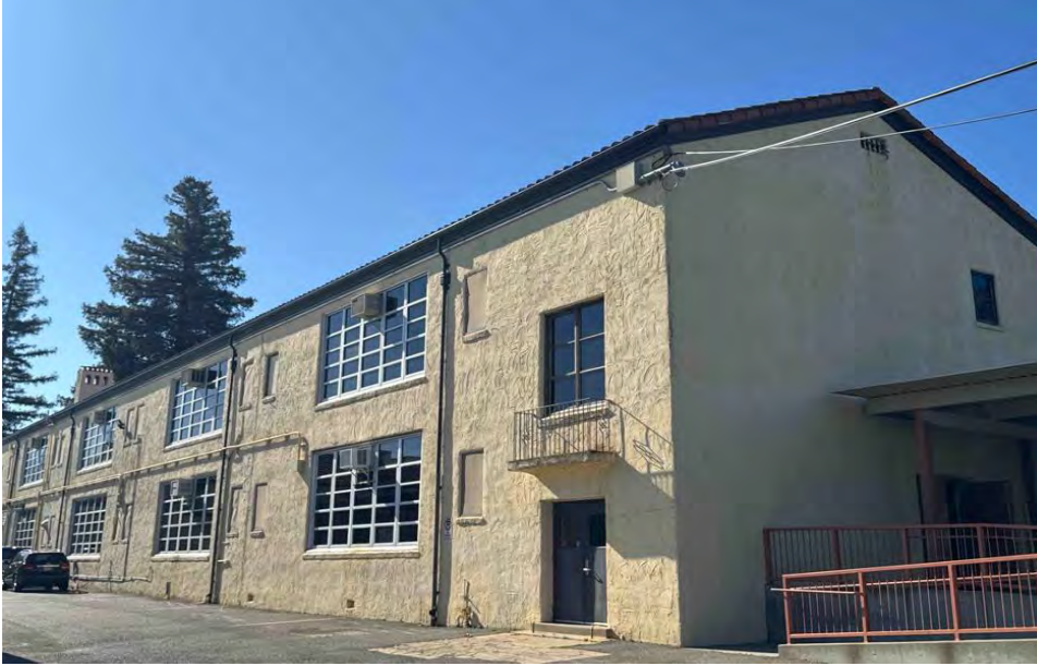
Photo 8 South and east elevations, camera facing northwest