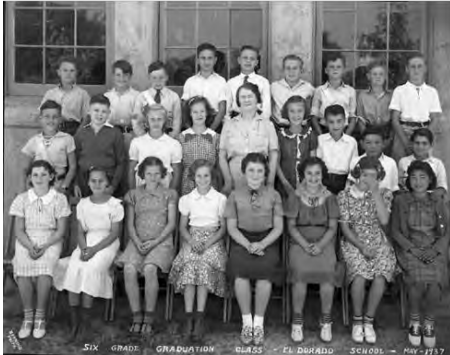
Figure 6 Class photo in front of auditorium, c. 1940