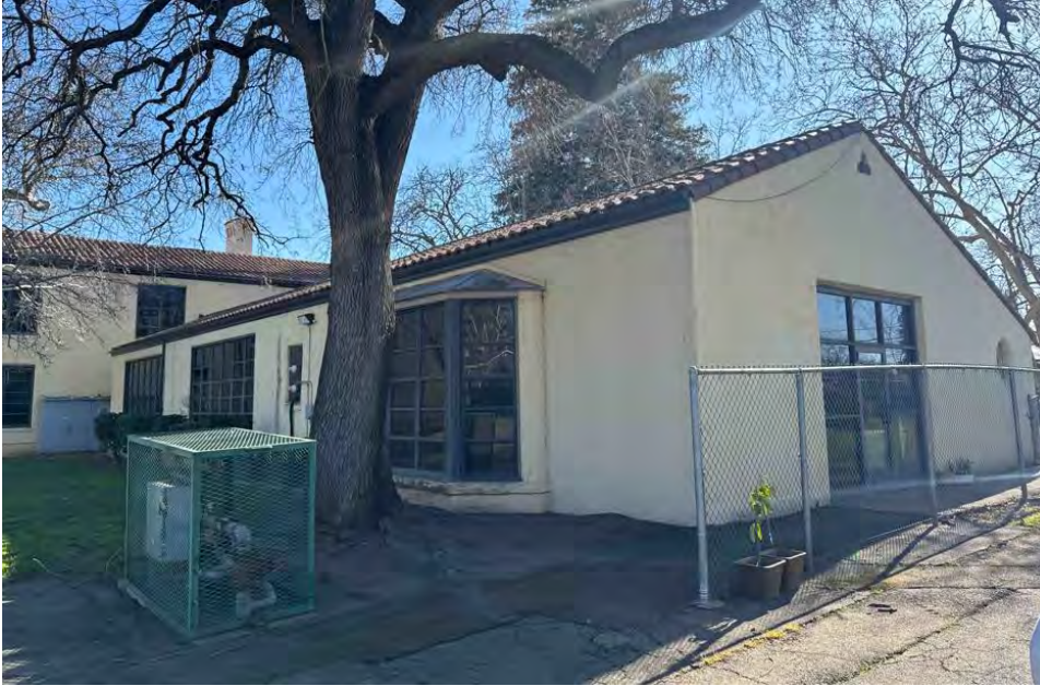
Photo 6 West elevation, camera facing southeast