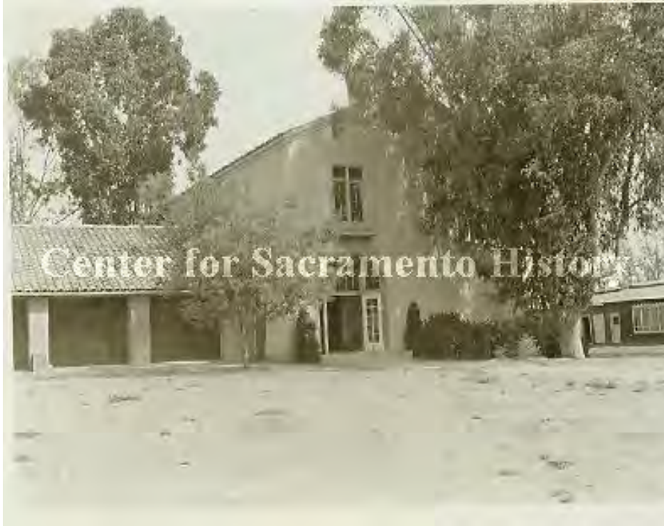
Figure 4 El Dorado School, 1940; Weinstock Collection, Center for Sacramento History