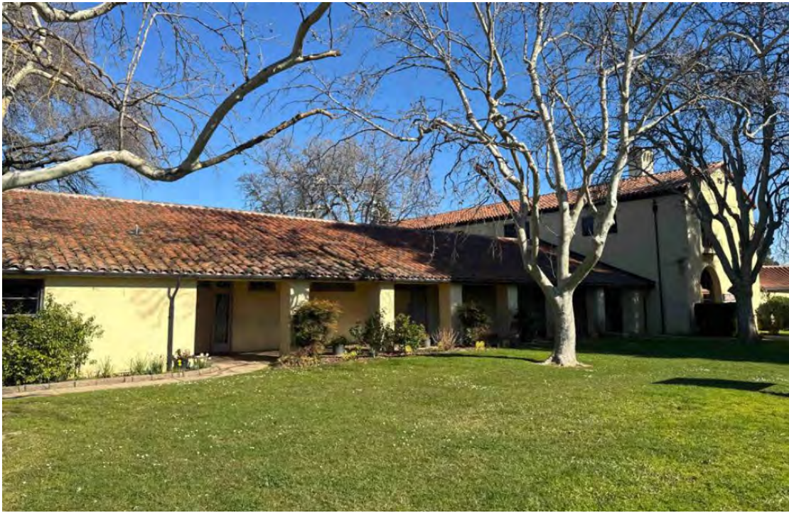
Figure 1: 5241 J Street

The property at 5241 J Street embodies the distinctive characteristics of a type, period, or method of construction (Sacramento City Code § 17.604.210.A.1.a.iii).