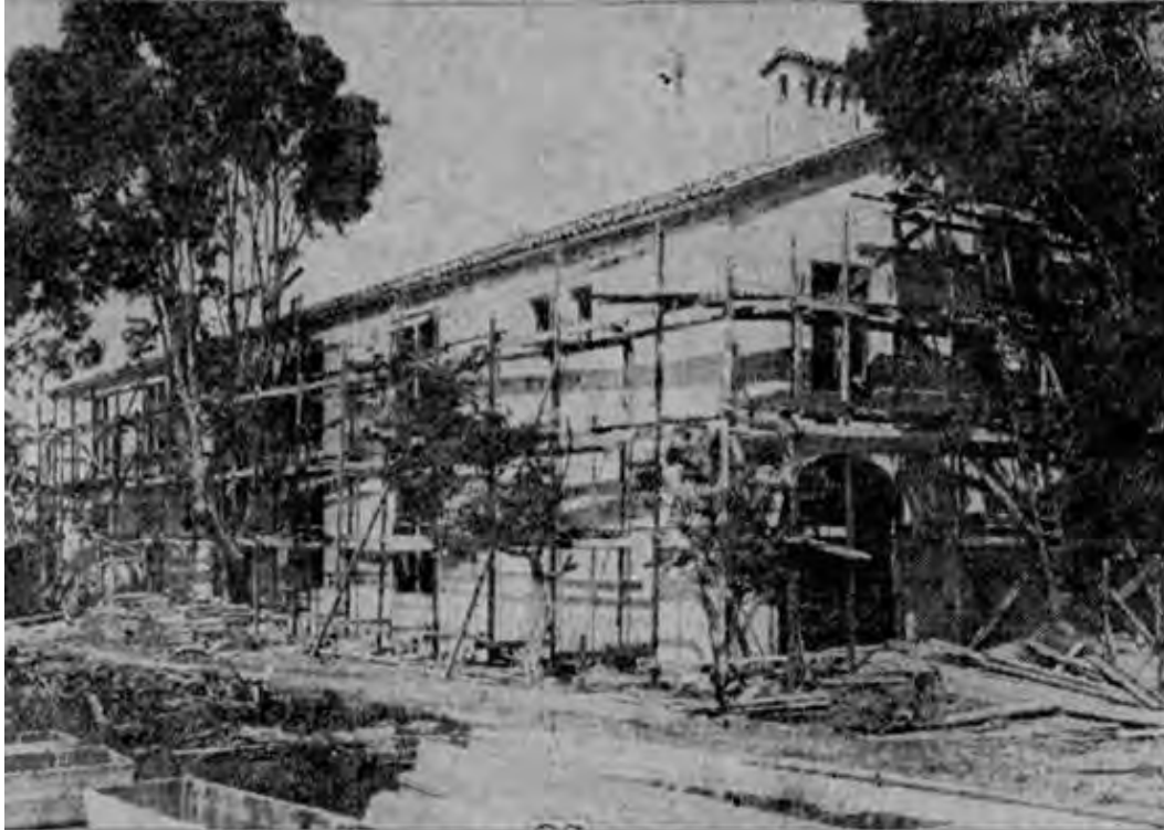
Figure 2 El Dorado School, 1922; Architect and Engineer, California