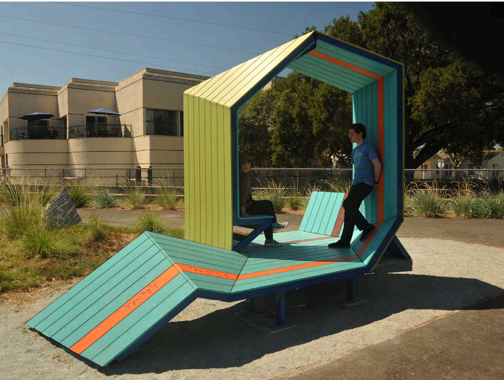
Settlement , 2025, Aluminum and recycled lumber, Palo Alto, CA