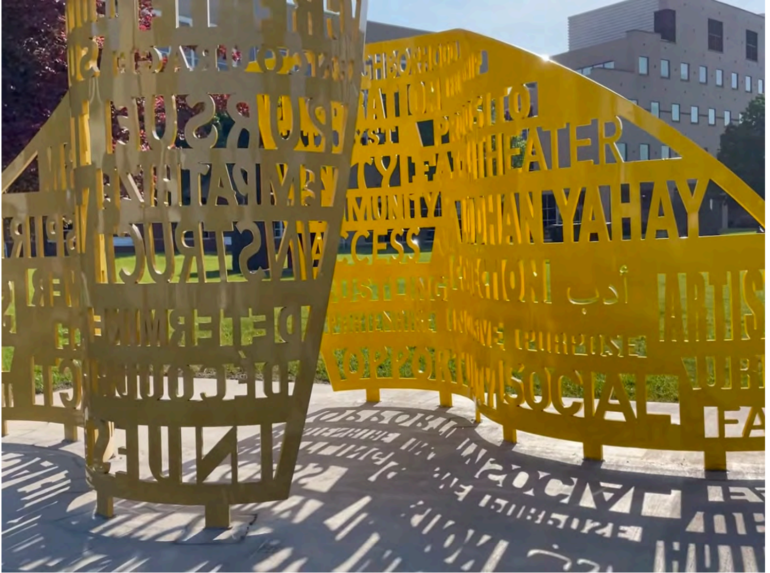
Vortex , 2022, Aluminum, powder-coated finish, Columbus, OH