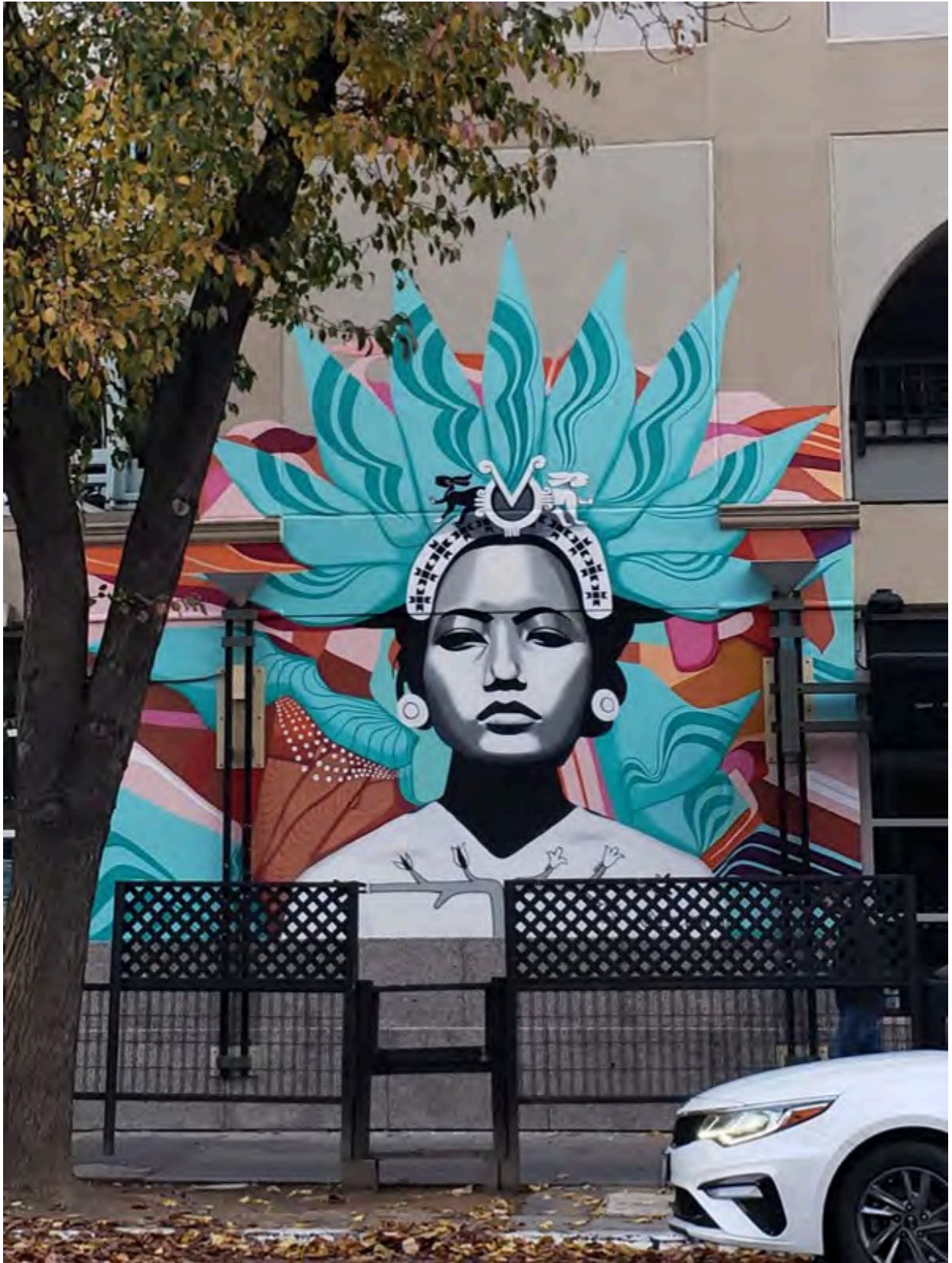
Mayahuel , 2022, Acrylic paint, Sacramento, CA