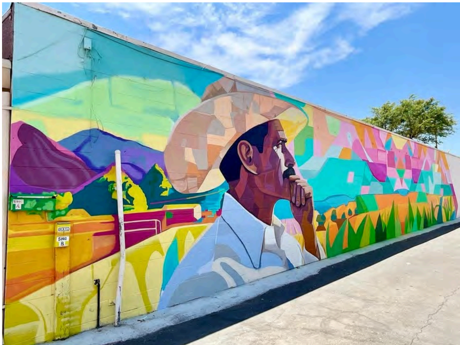
Siete de Pentaculos , 2025, Aerosol and Acrylic, Sacramento, CA