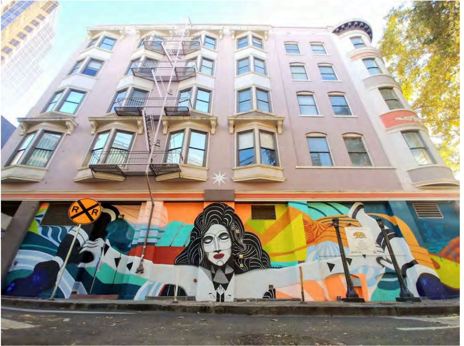
La Estrella , 2020, Aerosol and Acrylic, Sacramento, CA