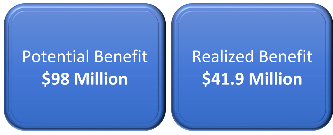
Figure 1: Potential Financial Benefit Identified and Estimated Financial Benefit Realized Since Establishment of the Office of the City Auditor

We expect that most of our work will yield both financial and non-financial benefits. Some examples of benefits captured include identifying revenue the City should have collected, errors that led the City to overpay expenses, and potential savings by modifying practices or agreements. Figure 1 illustrates the potential financial benefits identified in our reports as well as the estimated realized financial benefits resulting from the implementation of all recommendations made by the Office of the City Auditor.