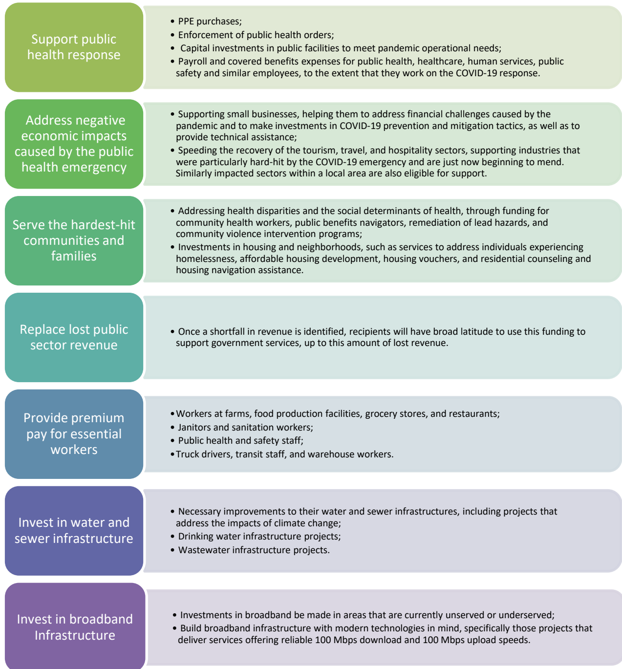
Figure 2: Examples of Eligible Expenses Under the Coronavirus Local Fiscal Recovery Fund