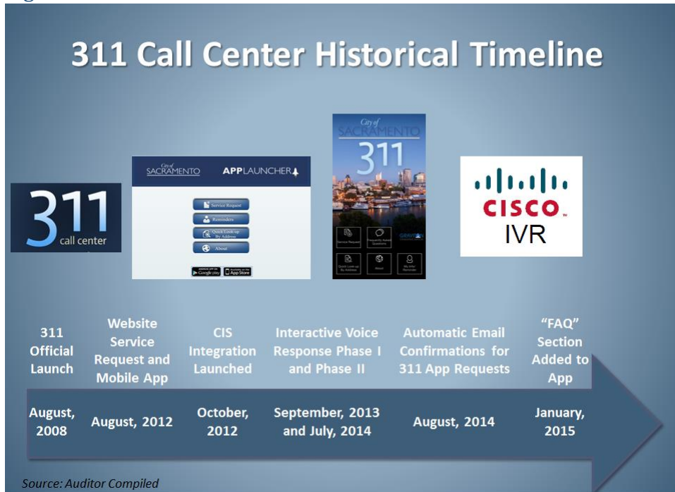
Figure 17: 311 Call Center Historical Timeline

Our review of the 311 Call Center’s Siebel data for fiscal year 2014 found most of the incidents received by the 311 Call Center were by phone. In addition, the top two call categories were informational requests and City service requests. Figure 18 below identifies the number of requests received by the 311 Call Center during fiscal year 2014 by category and method.