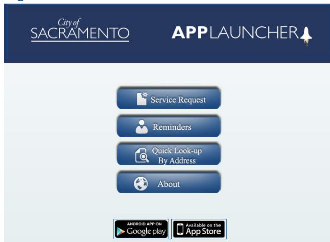
Figure 19: Screenshot of 311 Call Center Online Service Request Portal